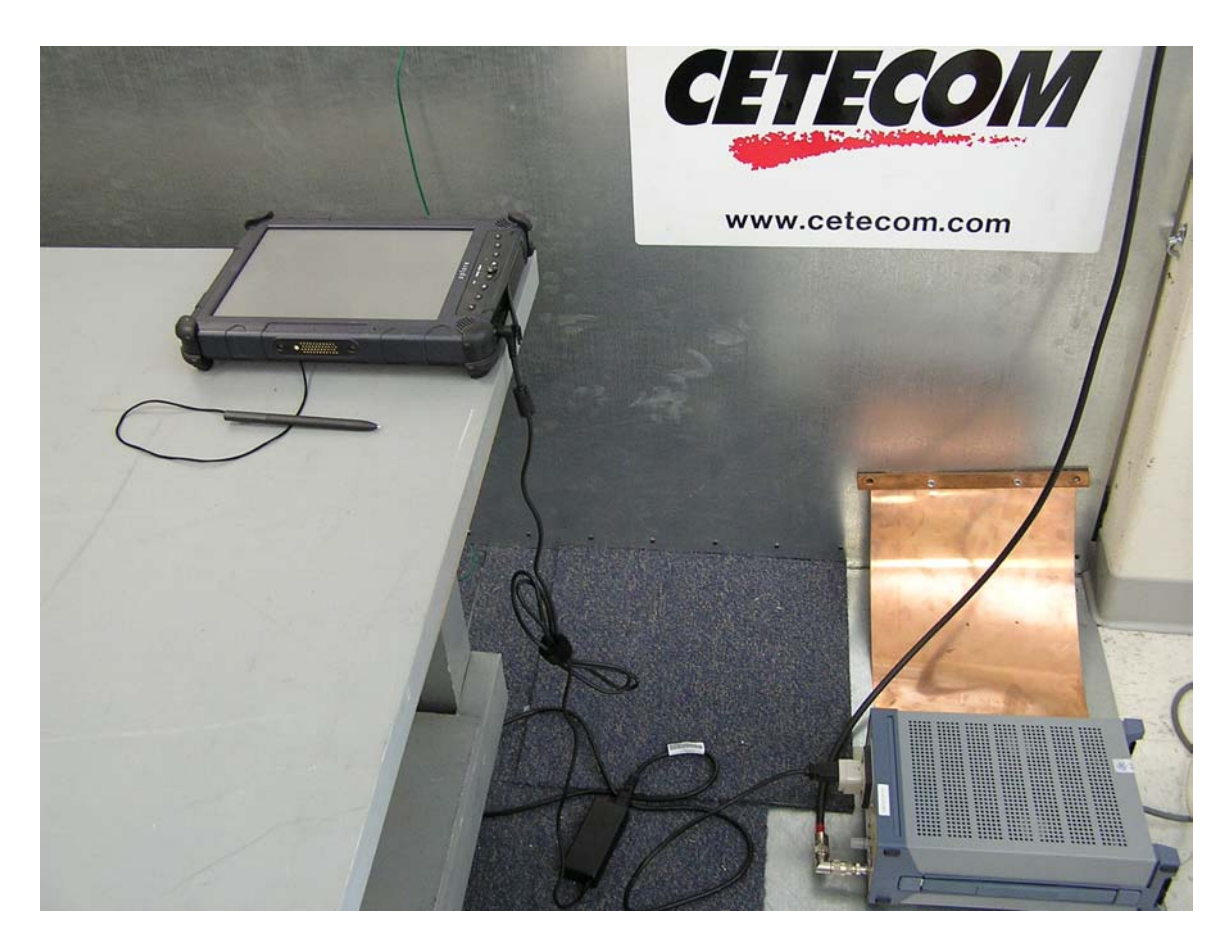
Test setup – AC Line conducted emissions