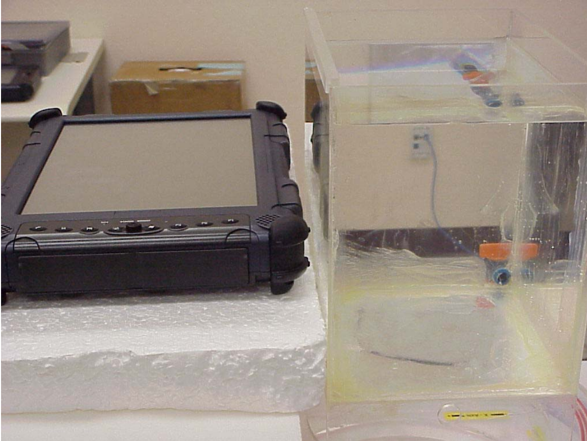
Photo 4. 2450 MHz antenna bystander position