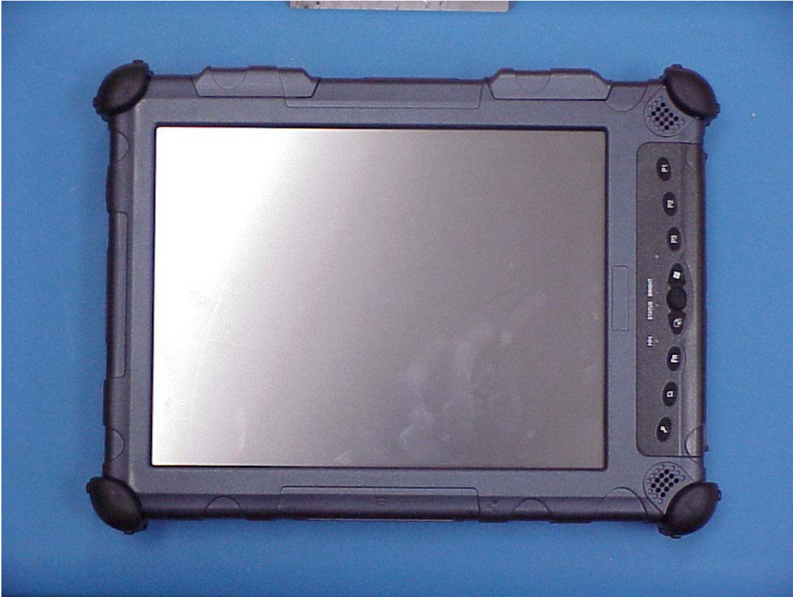
Photo 2. EUT front