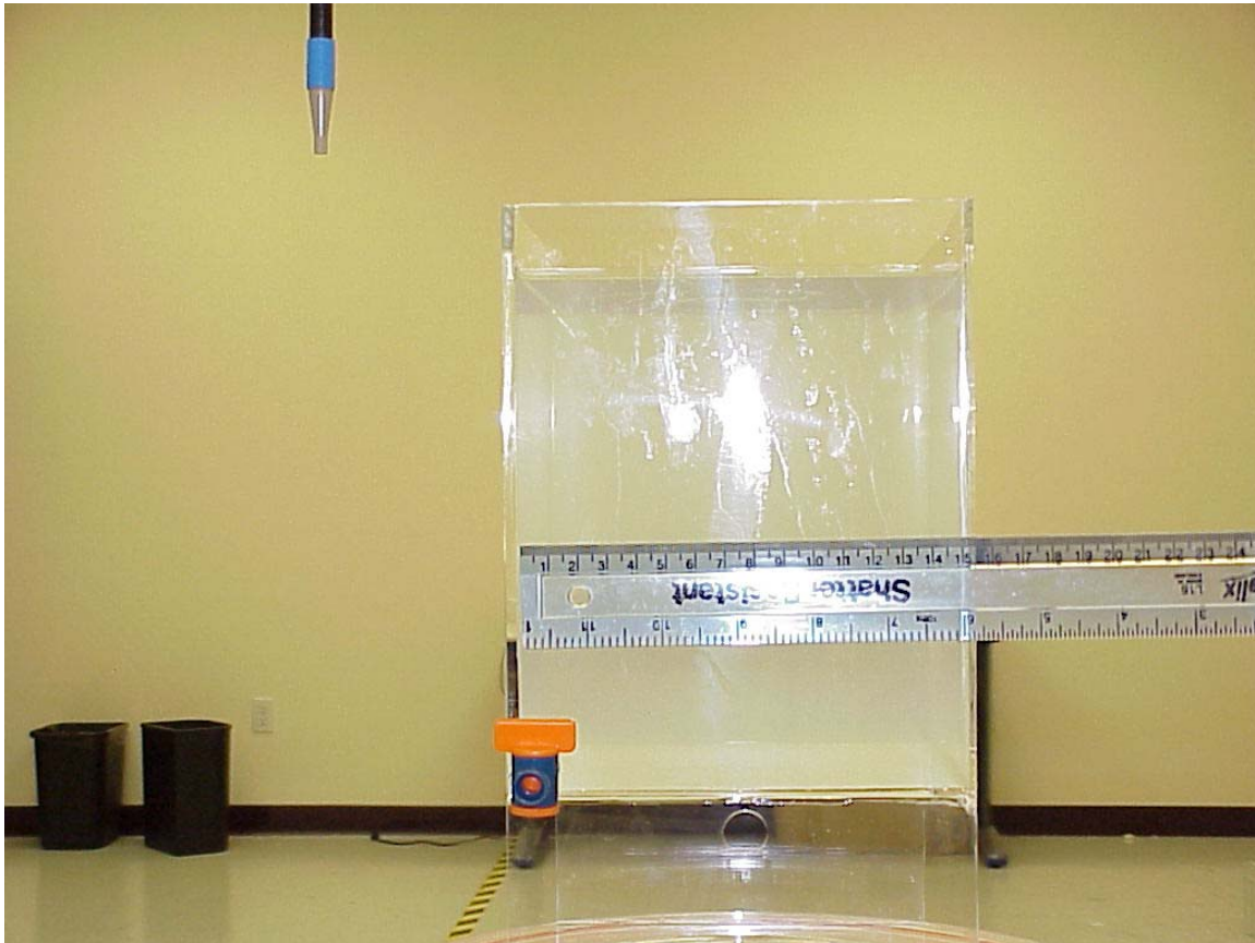
Photo 7. Photo to demonstrate 15 cm Z-axis flat phantom