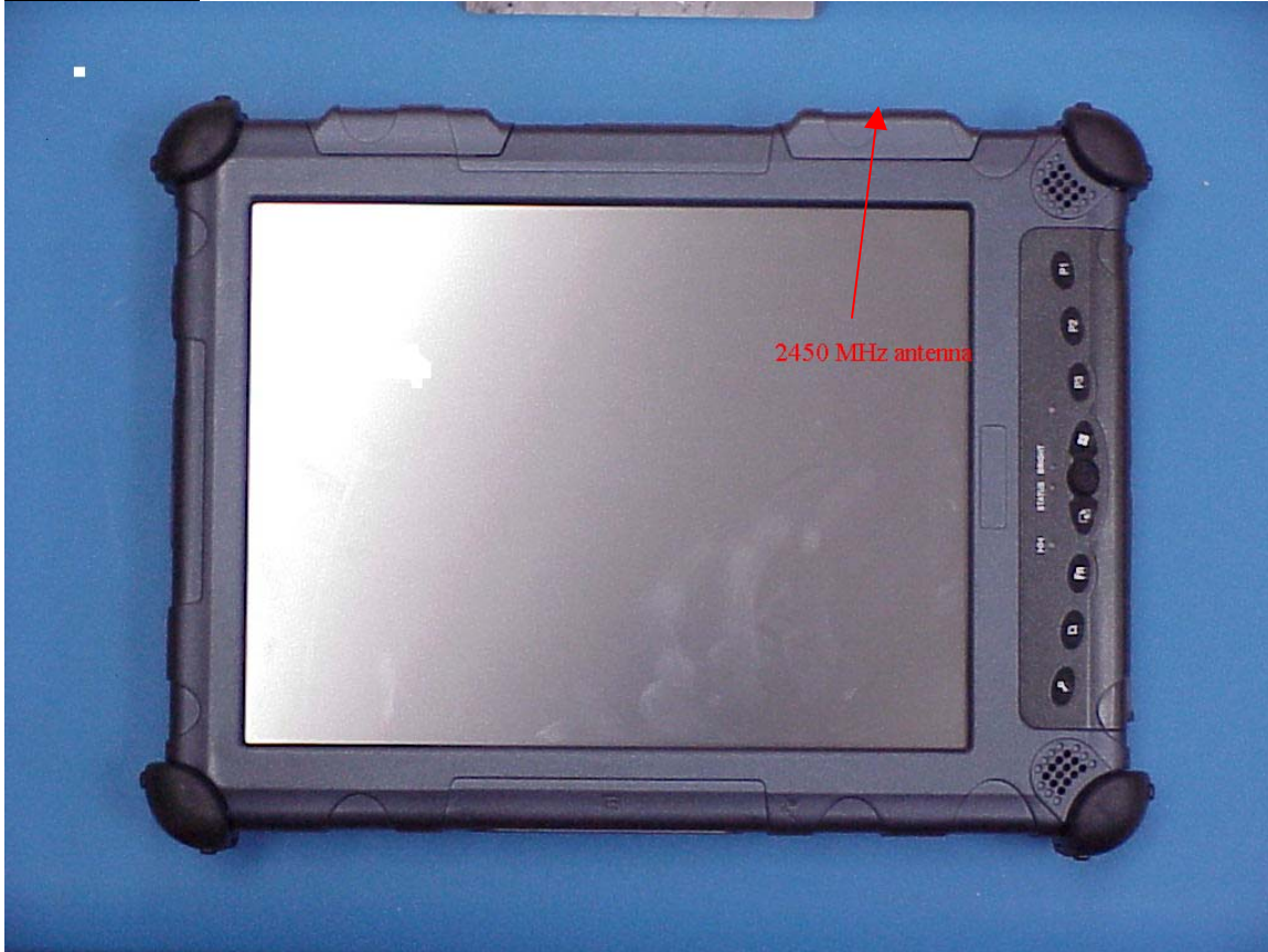
Photo 1. Antenna locations