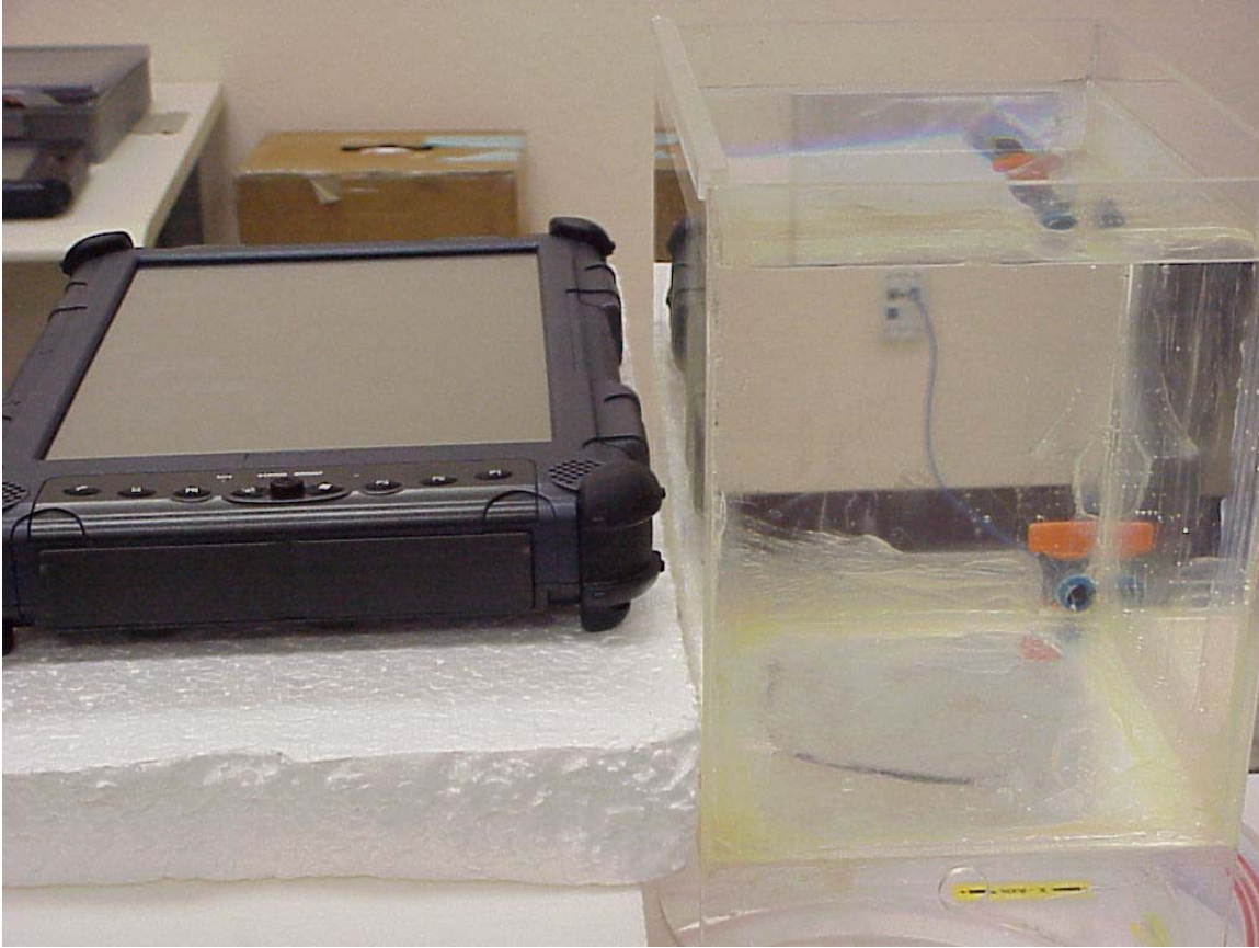
Photo 4. 2450 MHz antenna bystander position