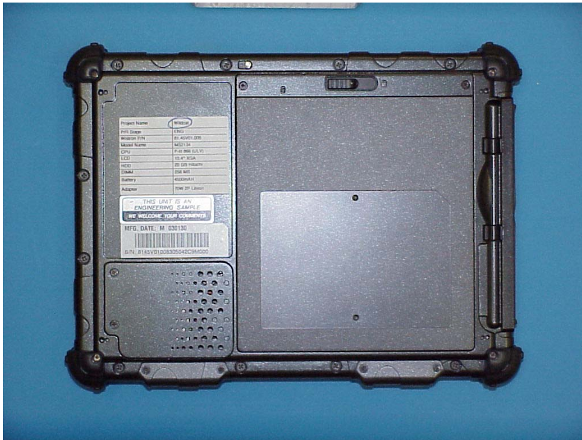
Photo 3. EUT back