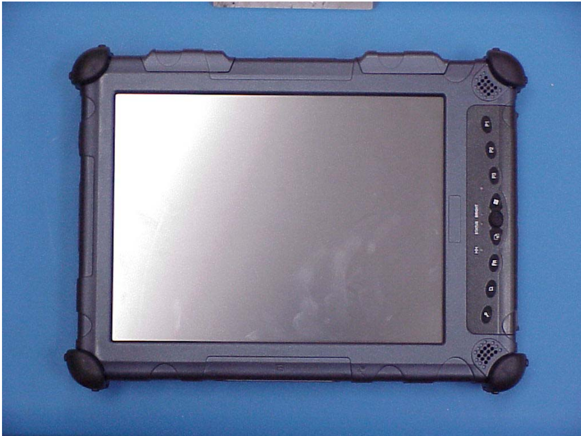
Photo 2. EUT front