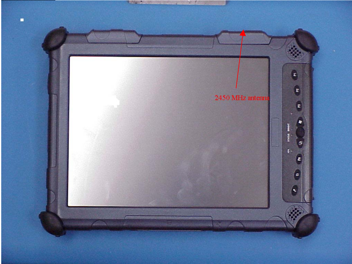
Photo 1. Antenna locations