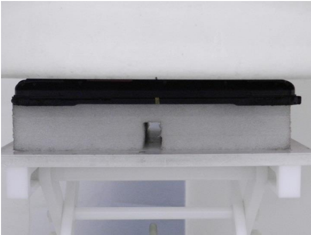
Bottom Face, Test Separation 0 cm