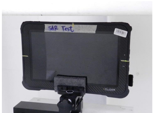
Edge1, Test Separation 1.5 cm