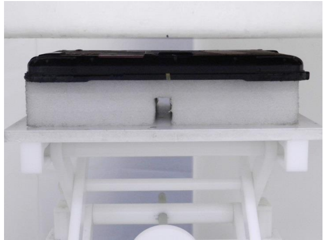
Bottom Face, Test Separation 1.3 cm