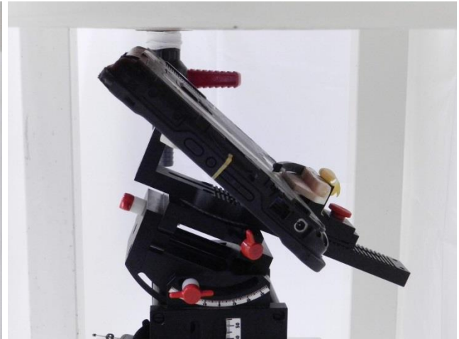
Curved surface of Edge1, Test Separation 0 cm