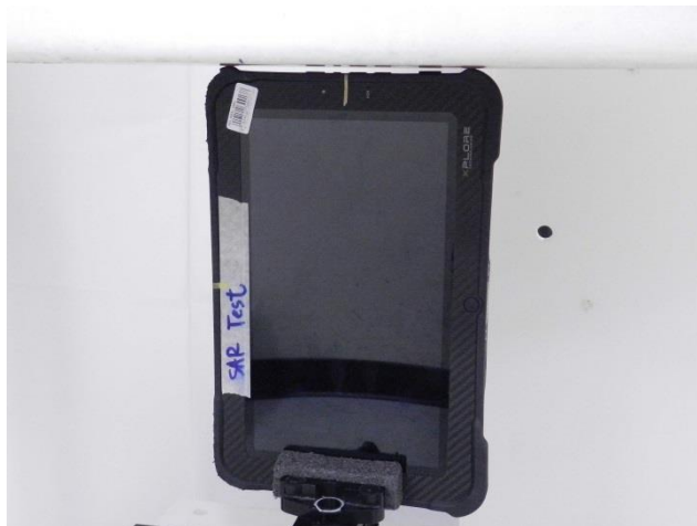
Edge2, Test Separation 0 cm