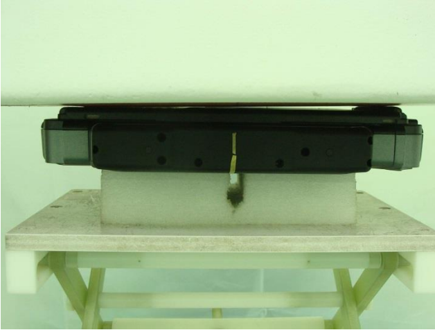
Bottom Face, Test Separation 0 cm