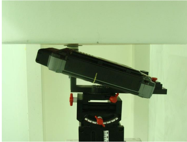
Curved surface of Edge1, Test Separation 0.7 cm