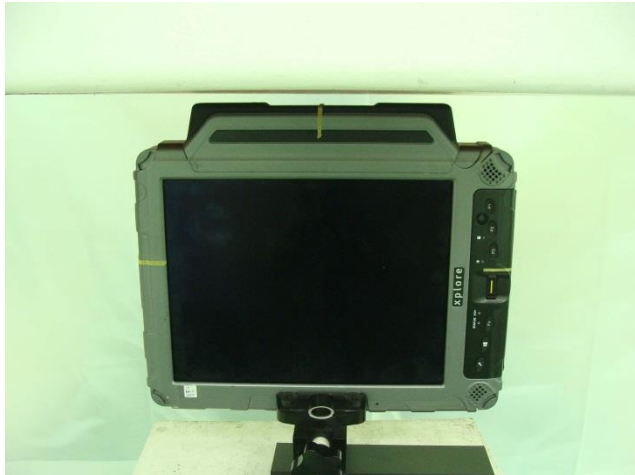
Edge1, Test Separation 0.7 cm