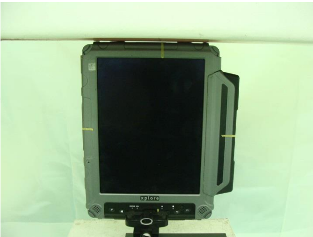
Edge4, Test Separation 0 cm