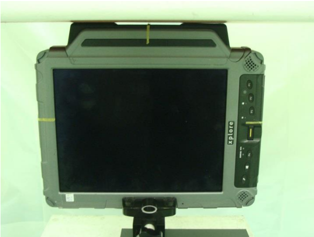
Edge1, Test Separation 0 cm