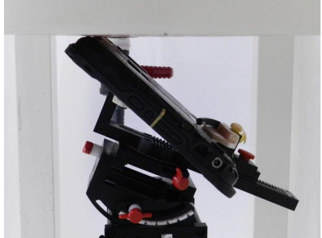
Curved surface of Edge1, Test Separation 0 cm