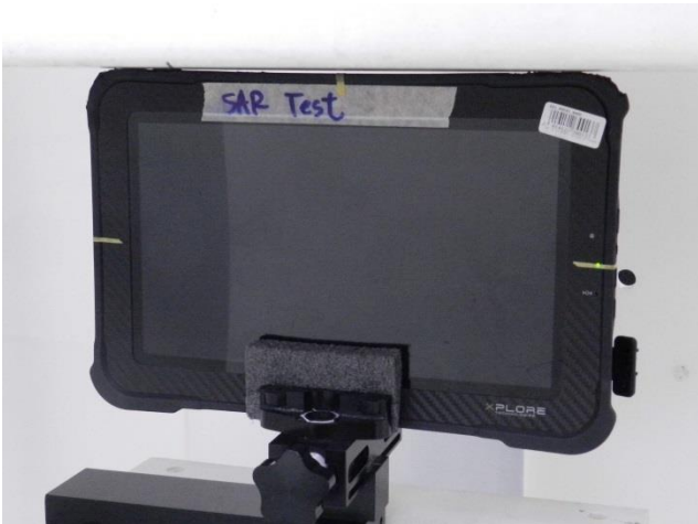
Edge1, Test Separation 0 cm