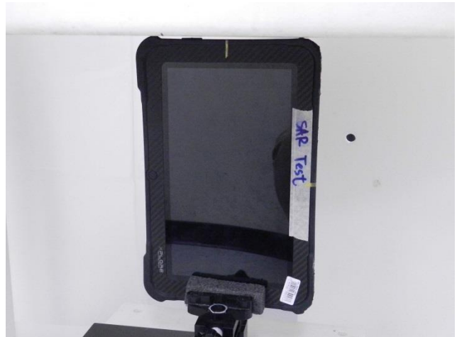
Edge4, Test Separation 0 cm