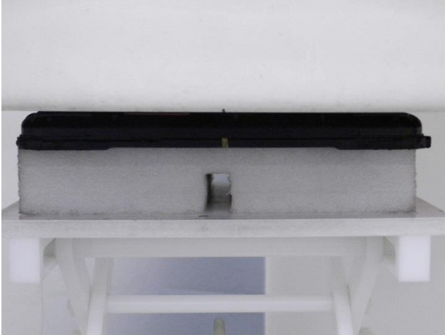
Bottom Face, Test Separation 0 cm