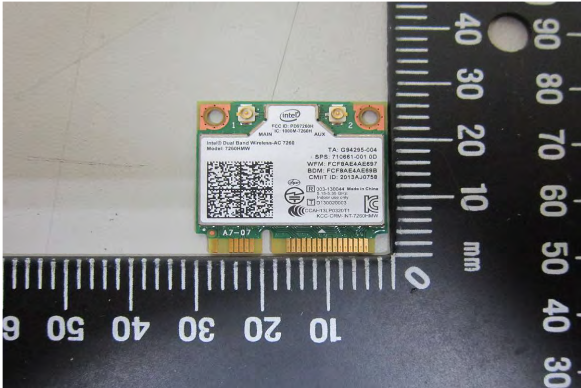
Back View of WLAN Module