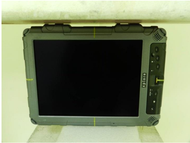
Edge1, Test Separation 0 cm