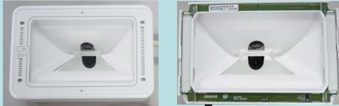
Antenna (Loop coil pattern on the PCB)