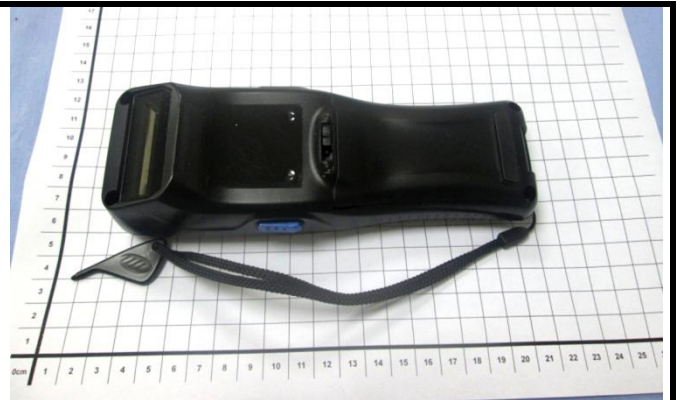
EUT + Scanner 1