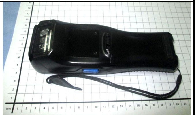
EUT + Scanner 2