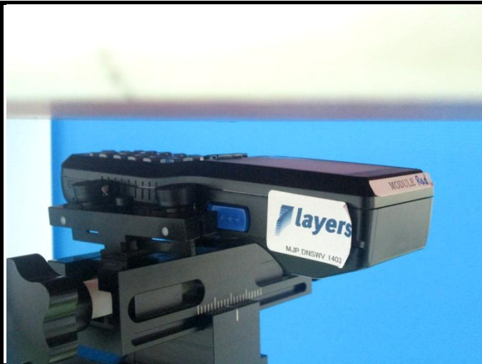
Front Face of EUT with 1.5 cm Gap (EUT + Scanner 1)