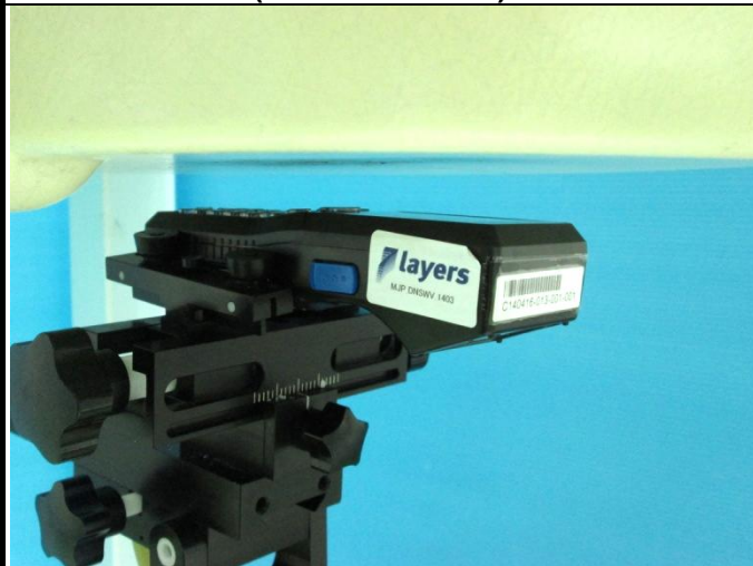
Front Face of EUT with 1.5 cm Gap (EUT + Scanner 2)