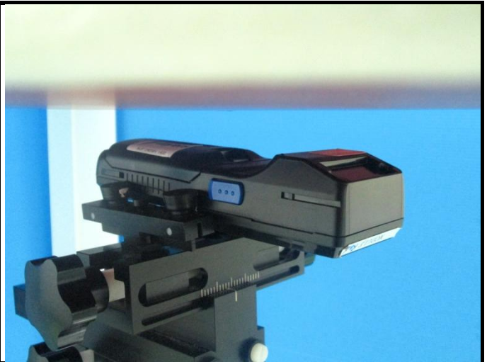
Rear Face of EUT with 1.5 cm Gap (EUT + Scanner 1)