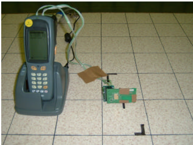
Worst Case Position Z-axis(Vertical)