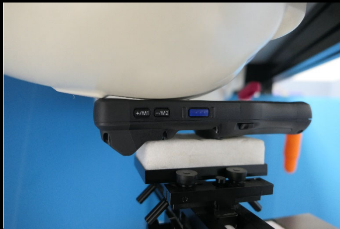
Right Cheek of EUT Tested