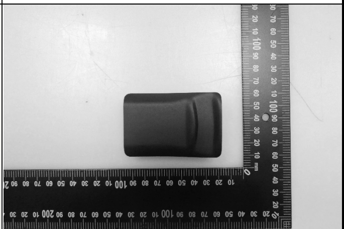
Rear Face of BT3