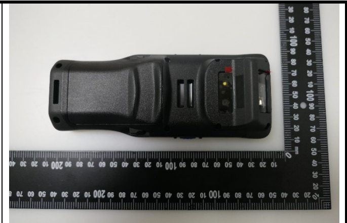
Rear Face of EUT