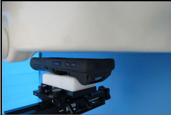
Front Face of EUT Tested at 10 mm