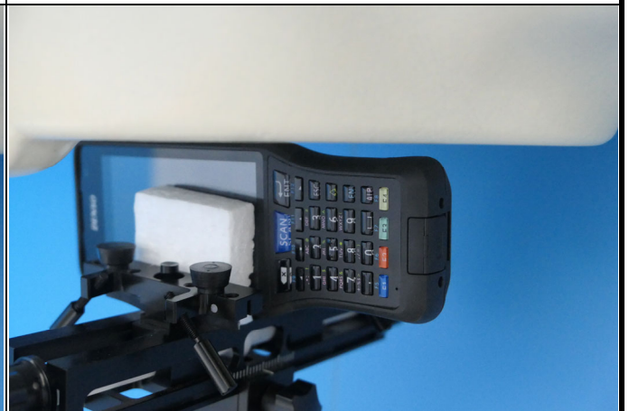
Right Side of EUT Tested at 0 mm