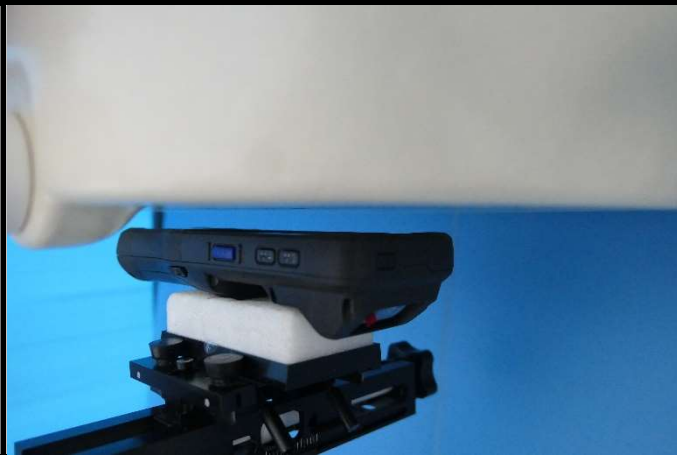
Front Face of EUT Tested at 10 mm