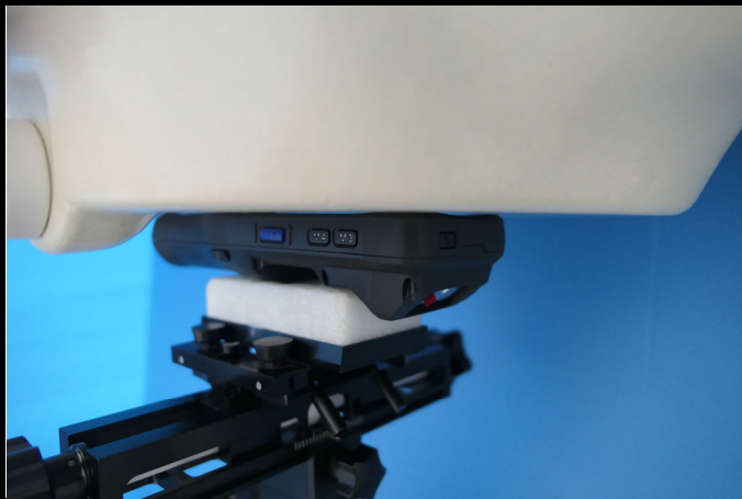
Front Face of EUT Tested at 0 mm