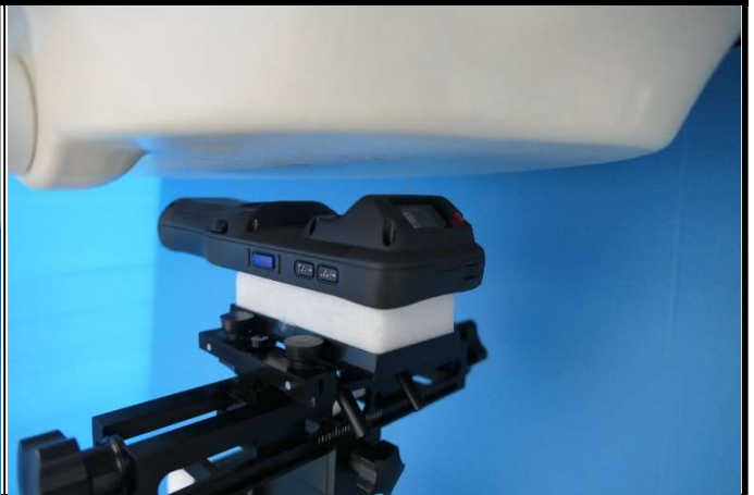
Rear Face of EUT Tested at 10 mm