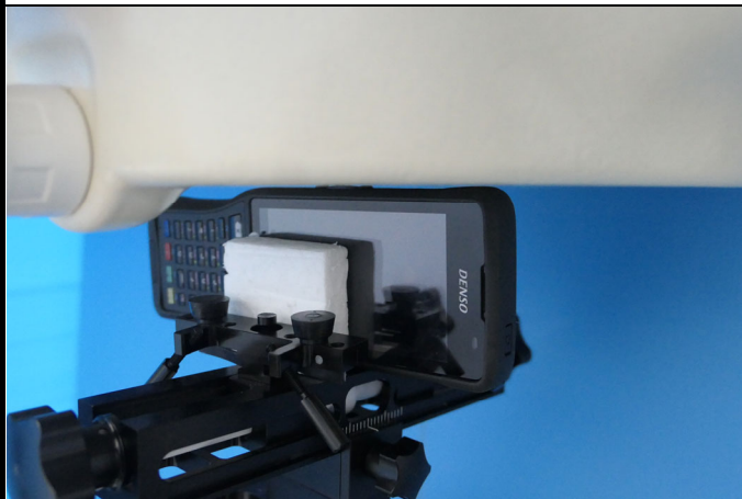
Left Side of EUT Tested at 0 mm