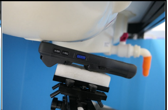
Right Tilted of EUT Tested