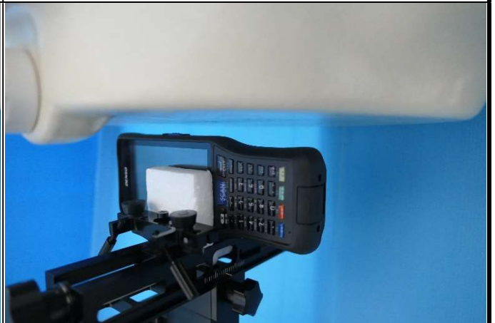
Right Side of EUT Tested at 10 mm