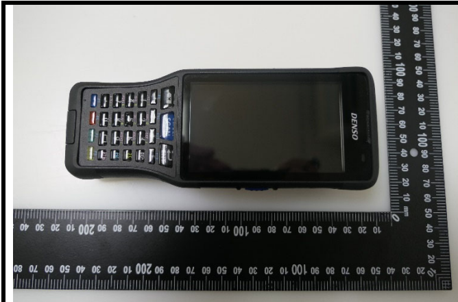
Front Face of EUT