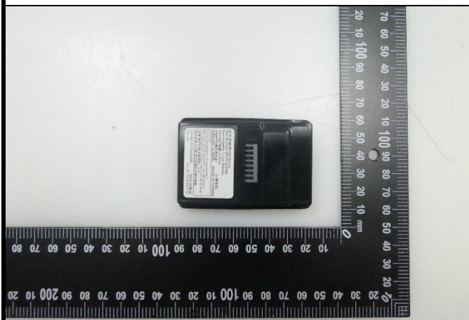
Front Face of BT3