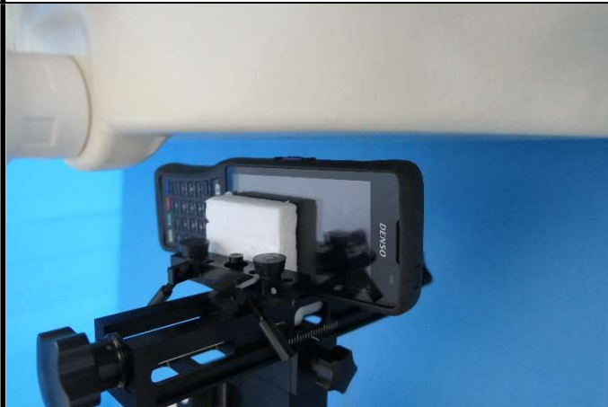
Left Side of EUT Tested at 10 mm