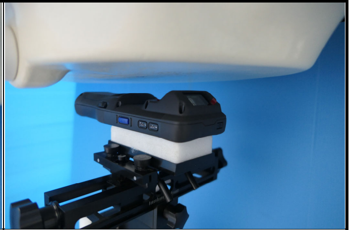
Rear Face of EUT Tested at 10 mm