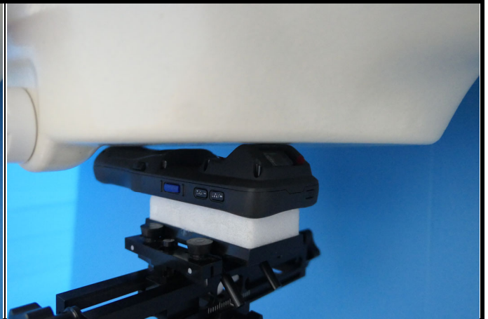
Rear Face of EUT Tested at 0 mm