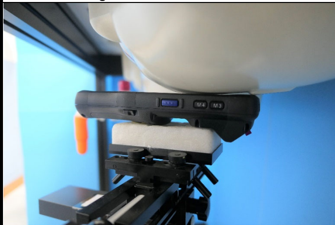
Left Cheek of EUT Tested