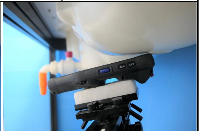
Left Tilted of EUT Tested