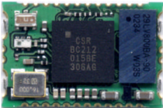
Internal (Component side)