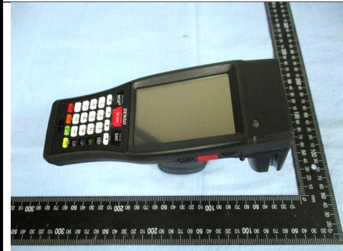
EUT Front Face