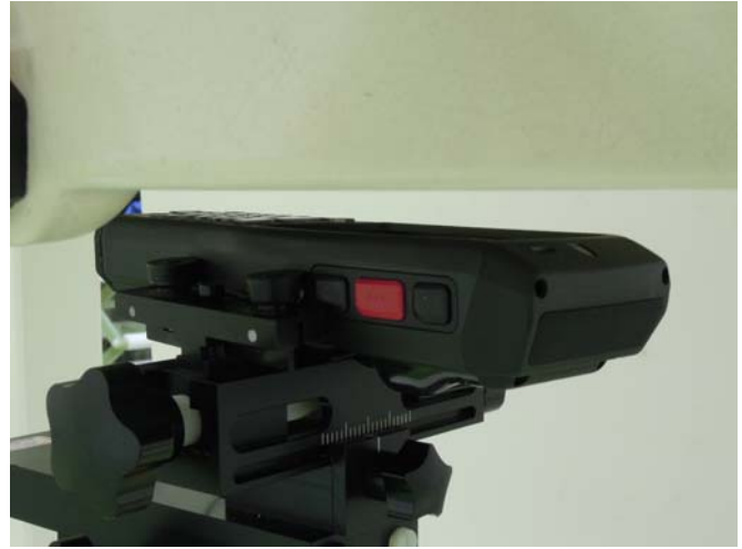
Front Face of EUT with 1.5 cm Gap (EUT + Battery 1)