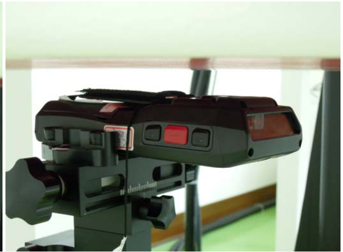
Rear Face of EUT with 1.5cm Gap (EUT + Battery 1)