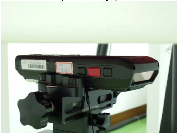
Front Face of EUT with 1.5 cm Gap (EUT + Battery 2)