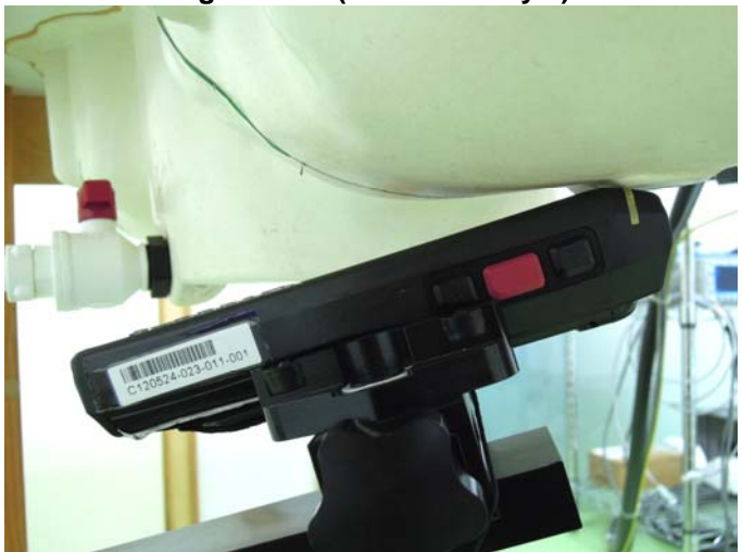
Left Tilted (EUT + Battery 1)