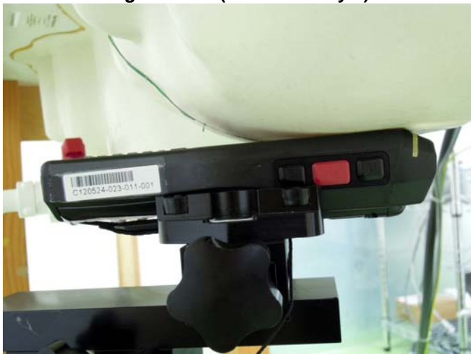
Left Cheek (EUT + Battery 1)