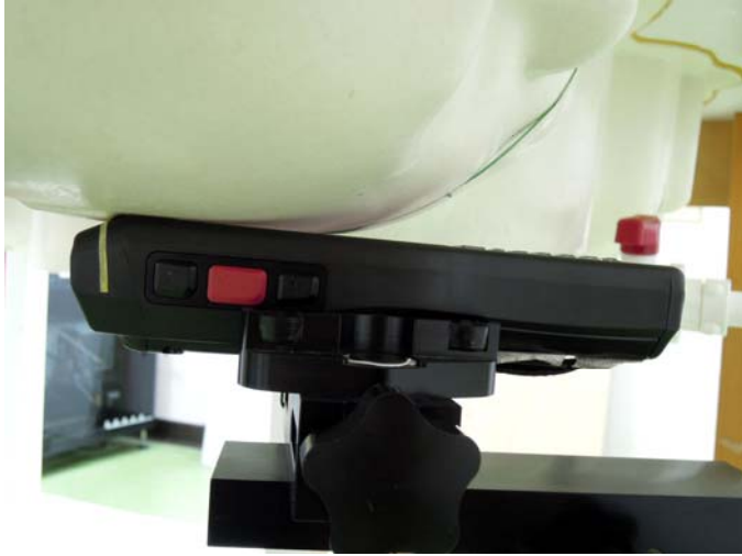
Right Cheek (EUT + Battery 1)