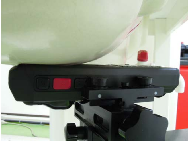
Right Cheek (EUT + Battery 1)