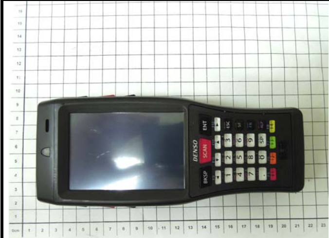
EUT + Battery 1