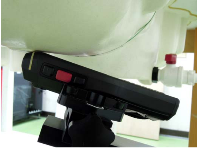
Right Tilted (EUT + Battery 1)