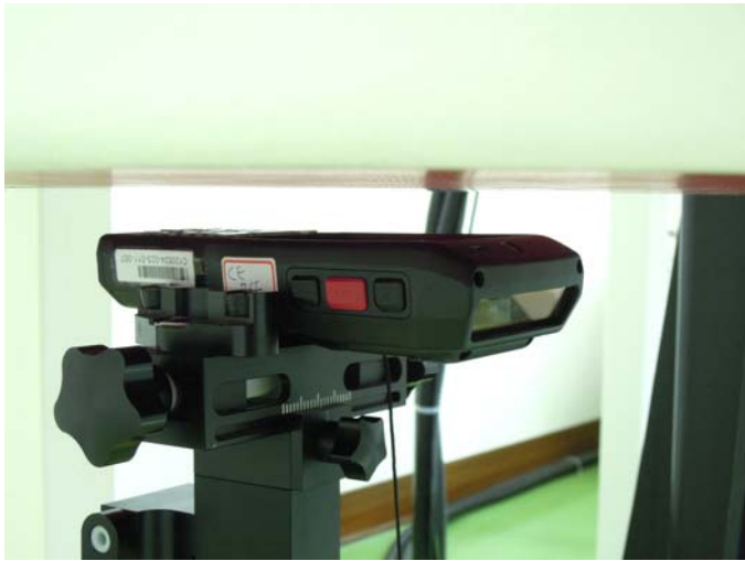
Front Face of EUT with 1.5 cm Gap (EUT + Battery 1)