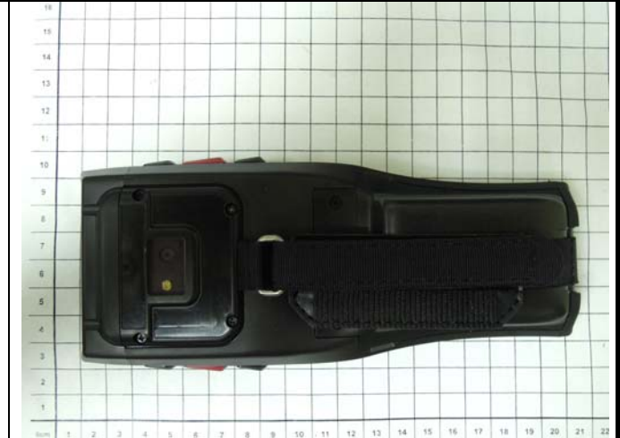
EUT + Battery 2