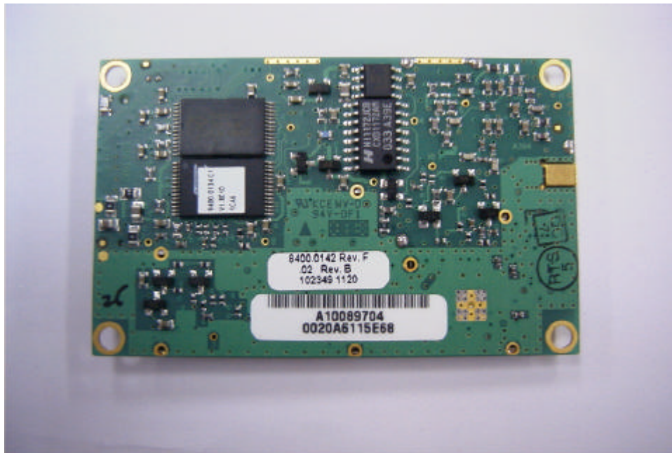
Circuit Board (Rear)