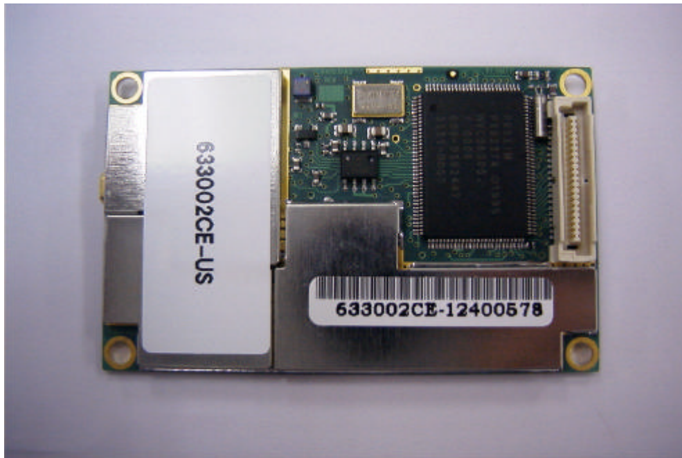
Circuit Board with shield (Front)