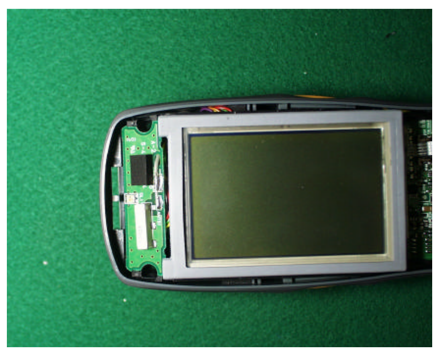
Antenna Circuit Board (Front) and Location