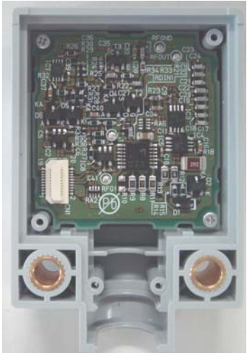
Main PCB sub assembly