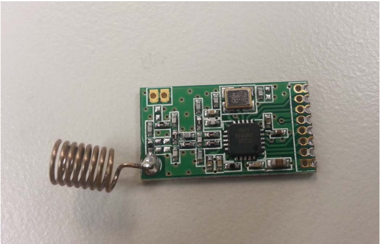
Photograph of RF Board: Component Side