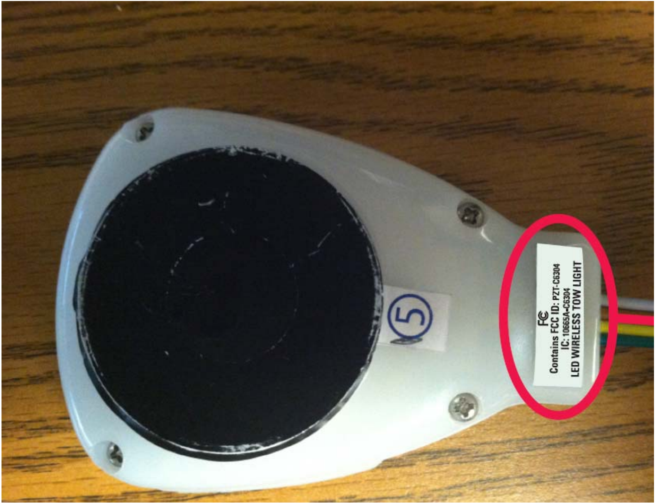
Location of Label on the Host.

The EUT will be labeled on the outside of the product. There is no label on the module itself since it is too small and it will not ever be sold separately. This is a limited modular and the installations will be controlled by Tiger Accessory group.