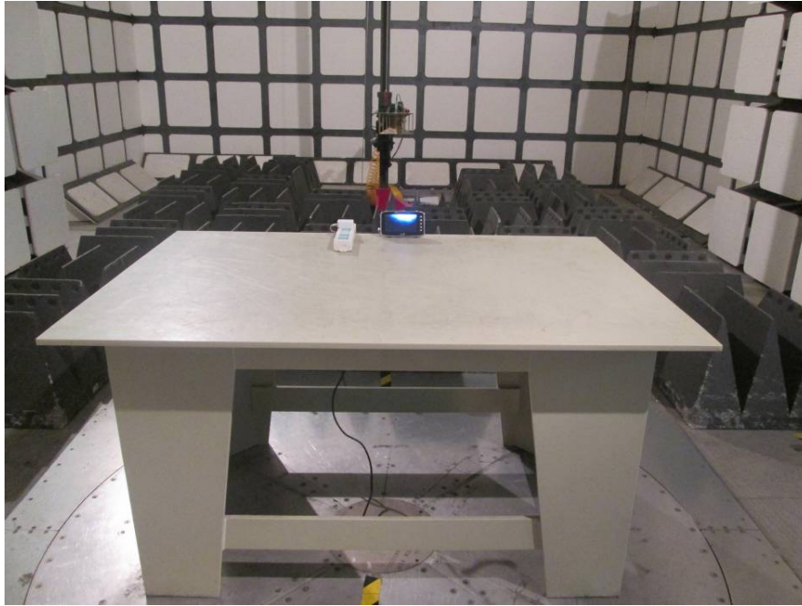
Radiated Emissions – Rear View (1-25 GHz)