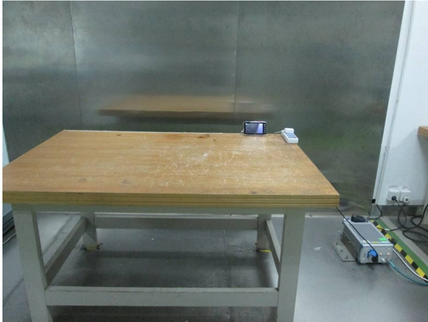
Conduction Emissions - Side View