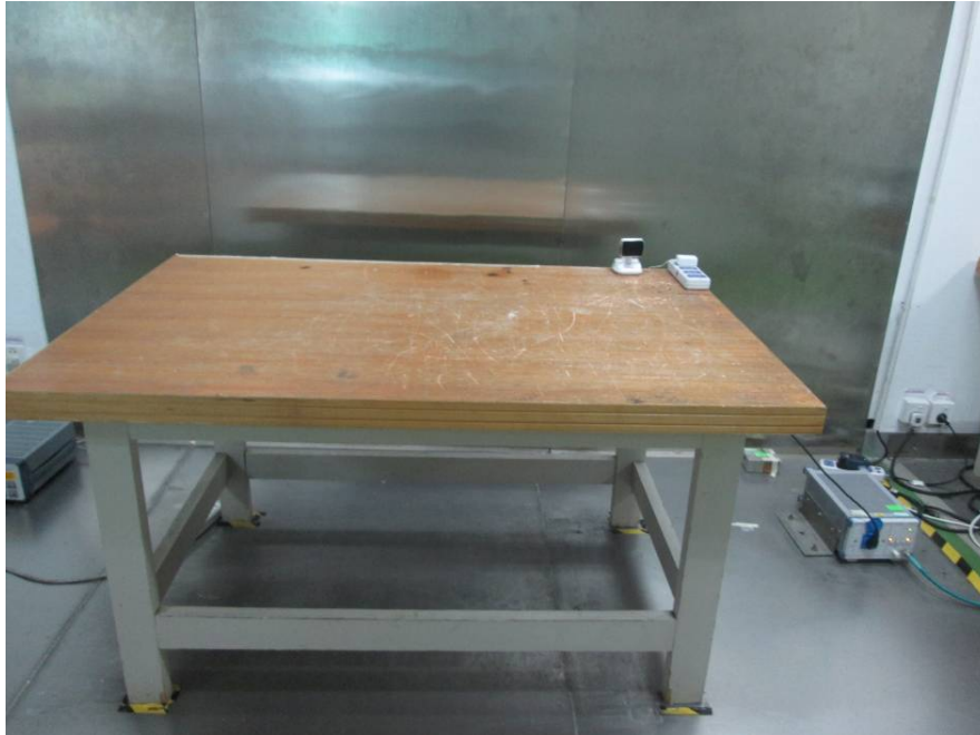
Conduction Emissions - Side View