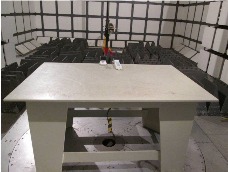
Radiated Emissions – Rear View (1-25 GHz)