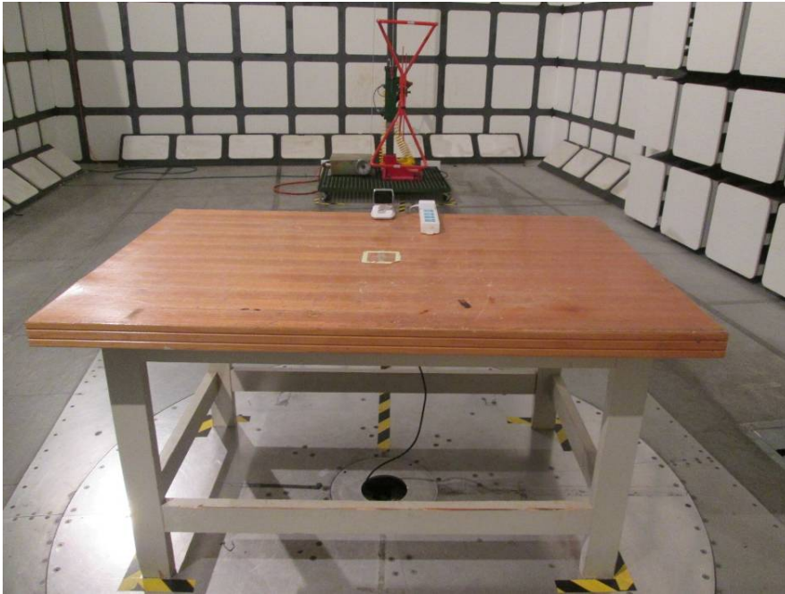
Radiated Emissions – Rear View (30-1000 MHz)