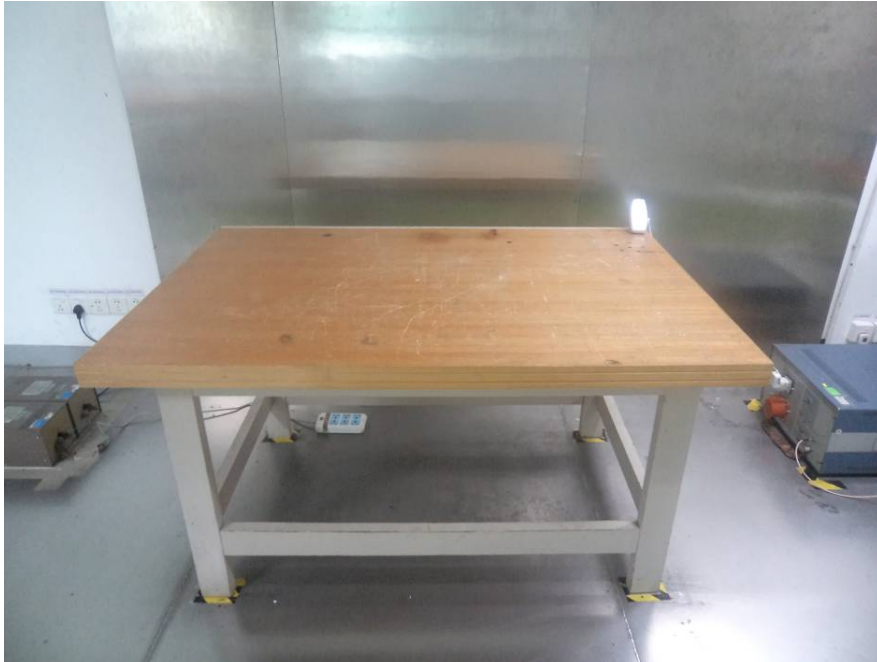
Conduction Emissions - Side View