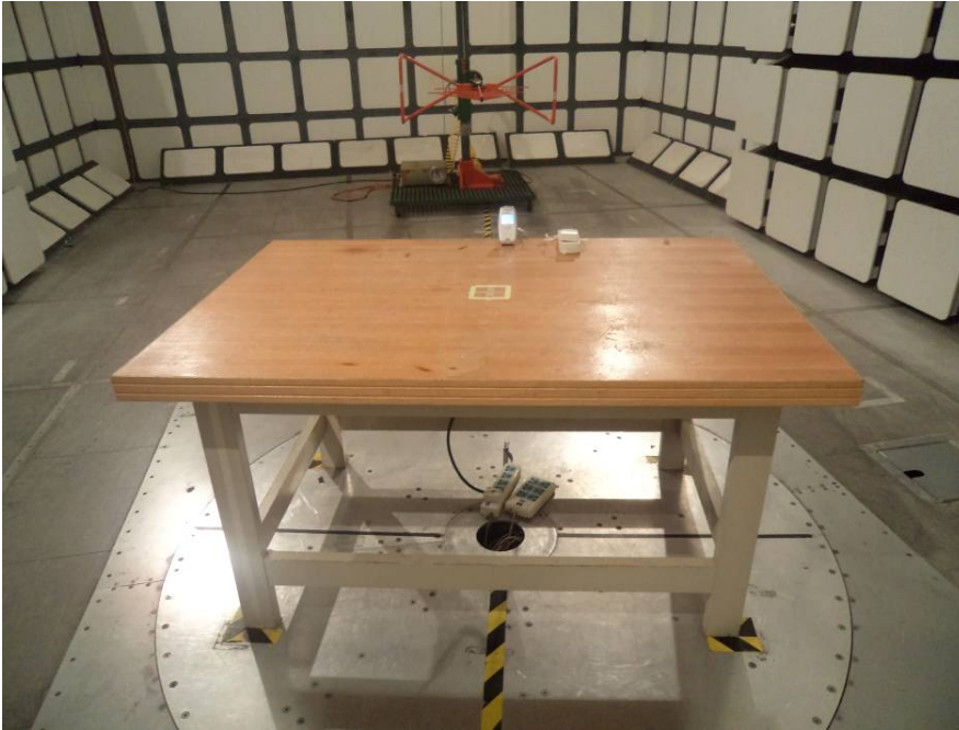
Radiated Emissions – Rear View (30-1000 MHz)