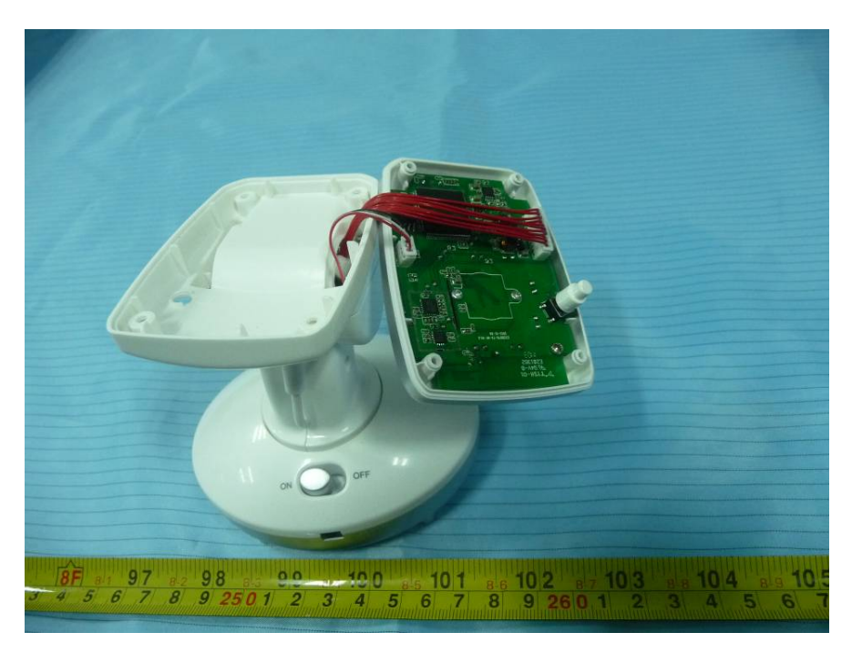
EXHIBIT C - EUT INTERNAL PHOTOGRAPHS