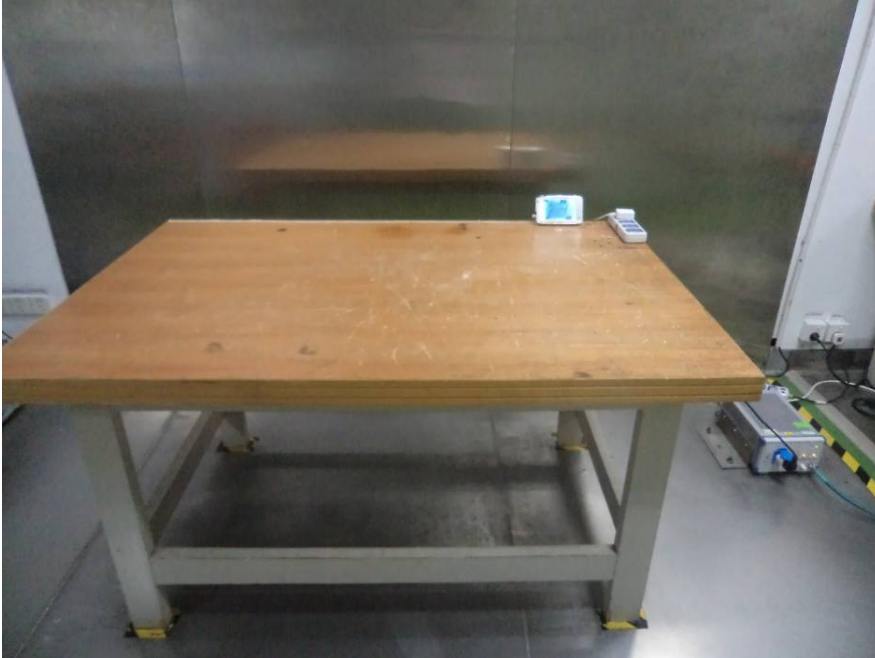
Conduction Emissions - Side View