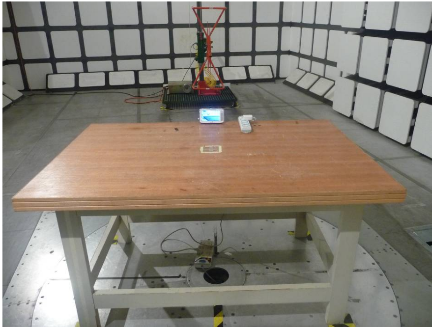
Radiated Emissions – Rear View (30-1000 MHz)