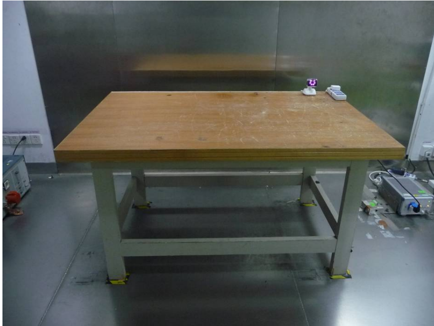
Conduction Emissions - Side View