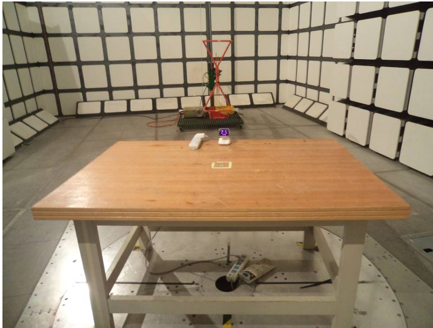
Radiated Emissions – Rear View (30-1000 MHz)