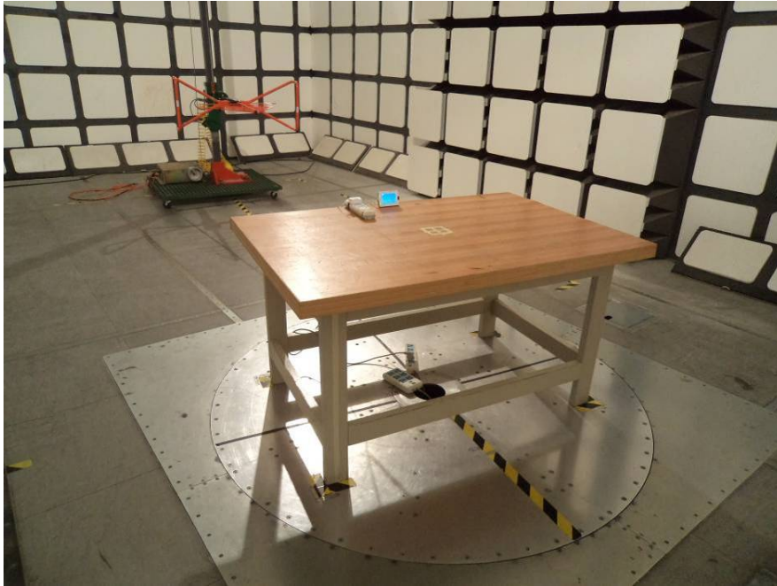
Radiated Emissions - Rear View (30-1000 MHz)