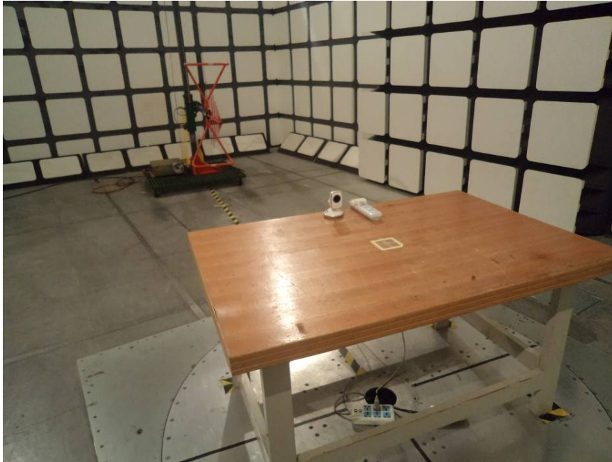
Radiated Emissions – Rear View (30-1000 MHz)