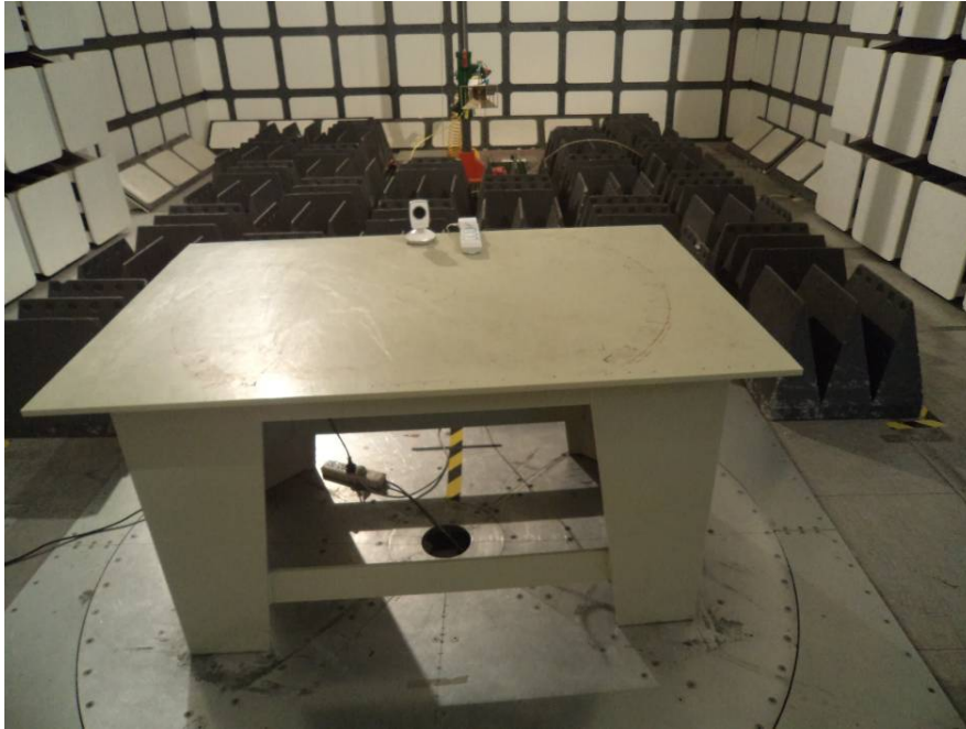
Radiated Emissions – Rear View (1-25 GHz)