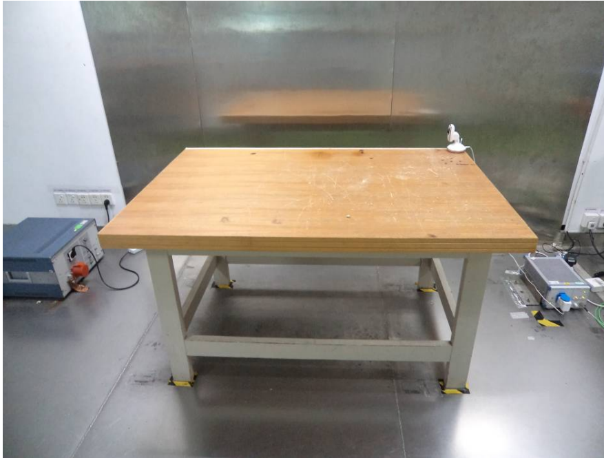
Conduction Emissions - Side View