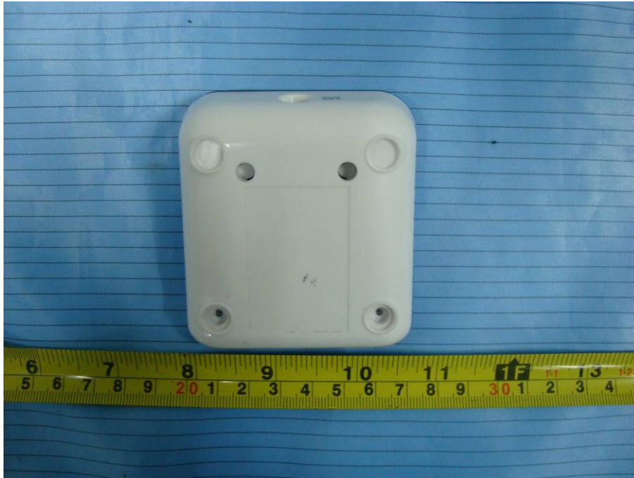
EUT – Side View