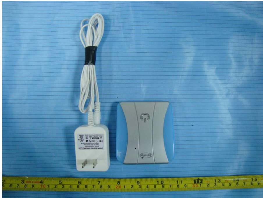
EUT – Top View