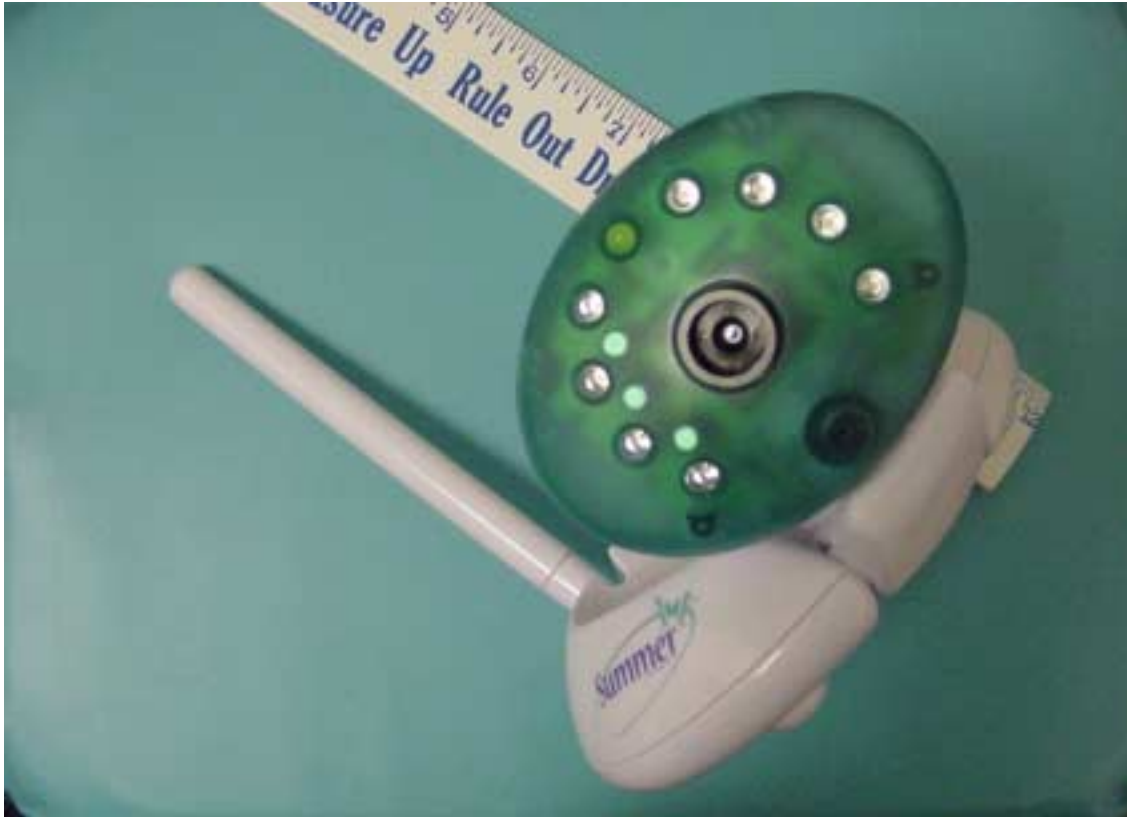
Front View, shows antenna, camera, microphone and IR LEDs for night illumination.