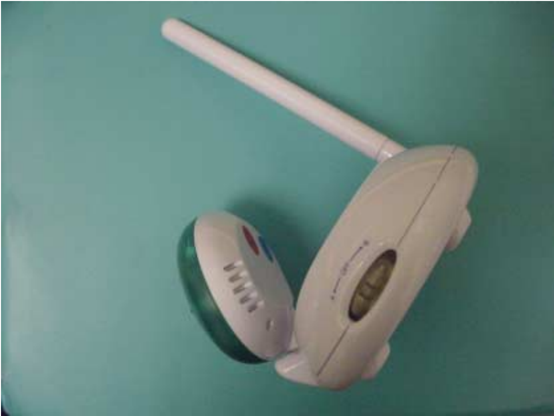
Left Side View, showing power/channel selector switch, final labeling will indicate 3 channels.