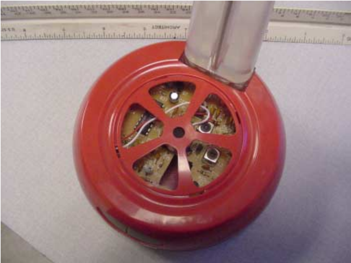
Top of EUT