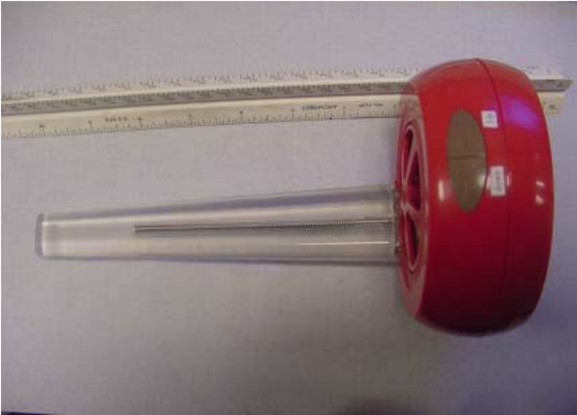
Front of EUT