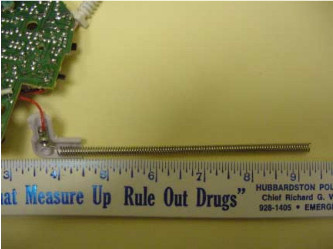
Antenna and connection