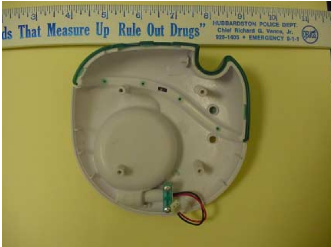
Inside Top Housing, showing microphone connector and wiring.