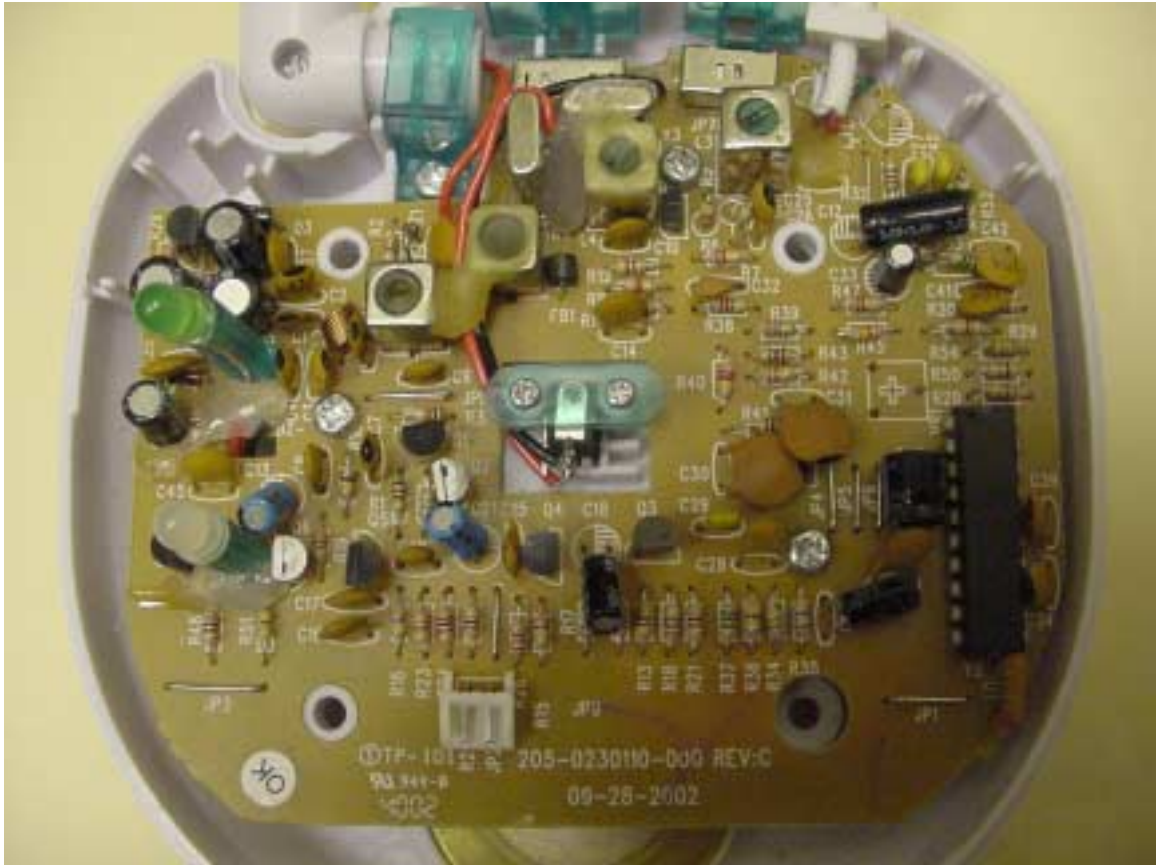
Component Side of Motion Sensor/RF board