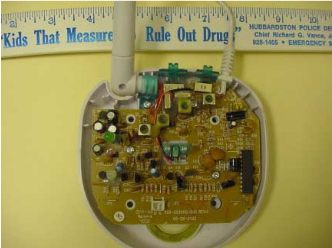
Inside View showing component side of motion sensor/RF board.