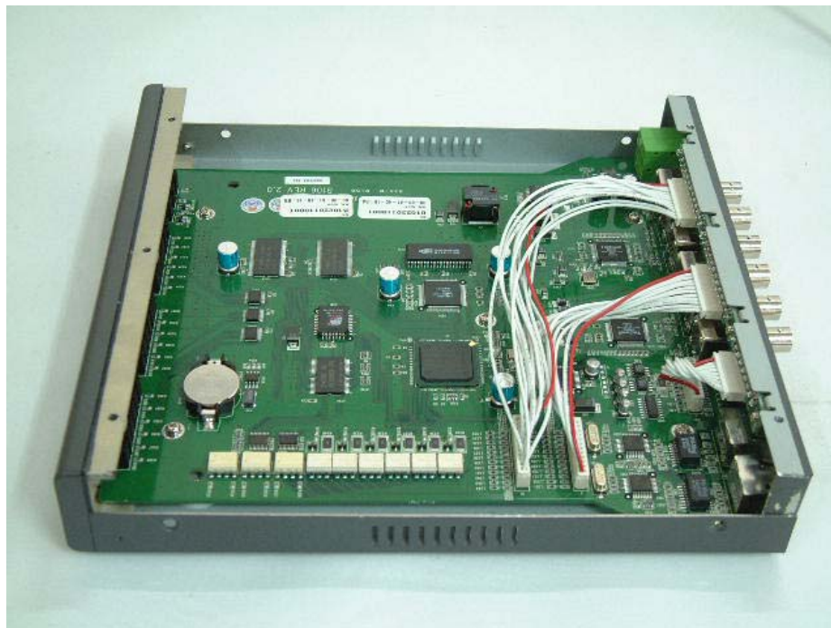
<INTERNAL VIEW OF E.U.T>