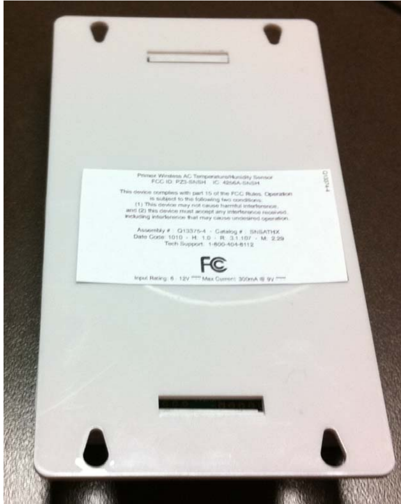
Photograph of EUT showing placement of Label