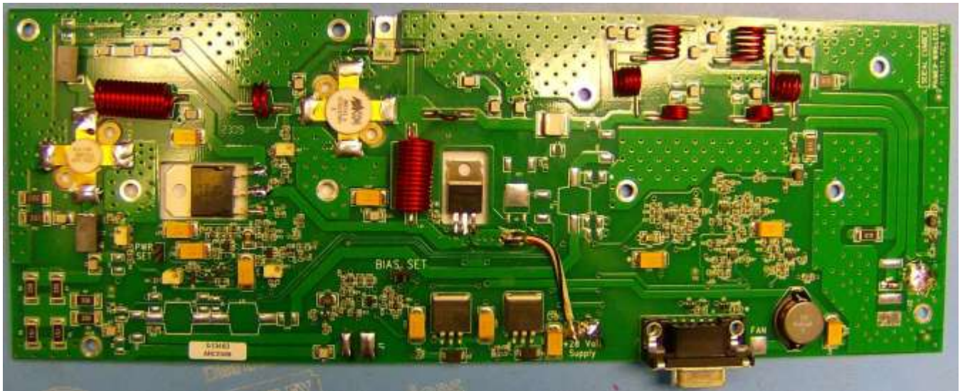
Photo One Amplifier PCB Component Side

Primex Wireless FCC ID: PZ3-PA Industry Canada ID: 4256A-PA