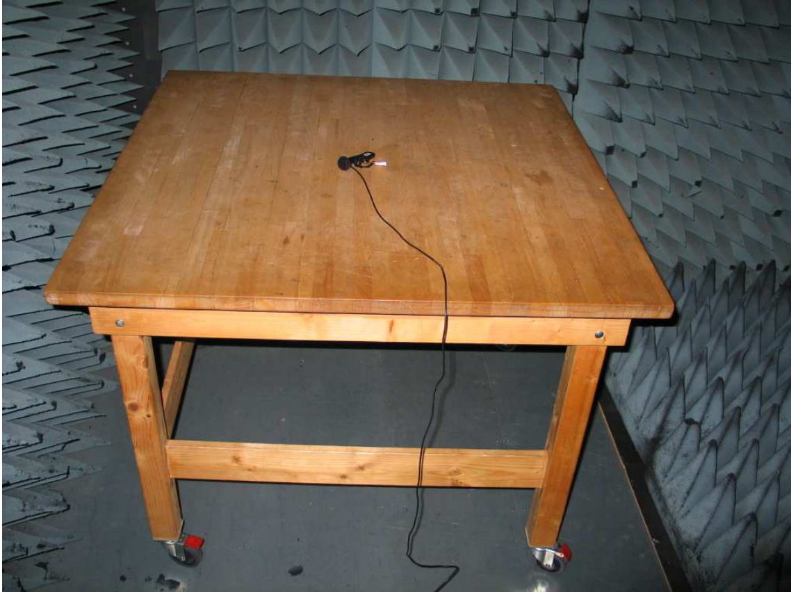
Photo 1: Test setup for radiated measurements (Enclosure, below 30 MHz)