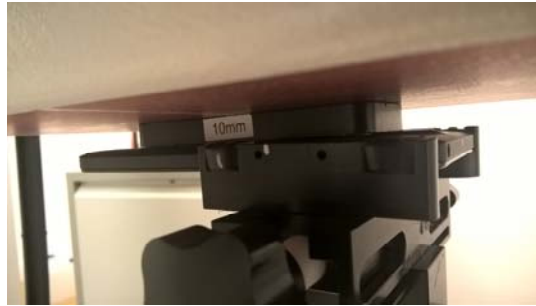
Photo of the device positioned for WR mode measurement –back facing phantom. The spacer was removed before the start of the measurements.

The device was placed in the SPEAG holder using the Microsoft spacer and, in sequence, the back, display and each of the 4 edges was positioned 10 mm away from the flat phantom. The spacer was removed before the start of the measurements.