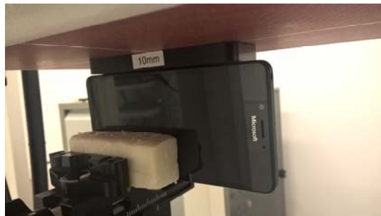
Photo of the device positioned for WR mode measurement – left edge facing phantom. The spacer was removed before the start of the measurements.