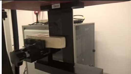
Photo of the device positioned for WR mode measurement – bottom edge facing phantom. The spacer was removed before the start of the measurements.