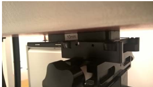
Photo of the device positioned for WR mode measurement – display facing phantom. The spacer was removed before the start of the measurements.