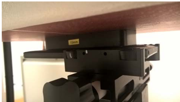
Photo of the device positioned for Body SAR measurement. The spacer was removed for the tests.

The device was placed in the SPEAG holder using the Microsoft spacer and placed below the flat phantom. The distance between the device and the phantom was kept at the separation distance indicated in the photo below using a separate flat spacer that was removed before the start of the measurements. The device was oriented with both sides facing the phantom to find the highest results.