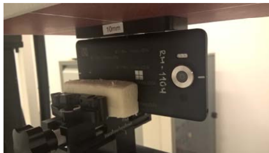
Photo of the device positioned for WR mode measurement – right edge facing phantom. The spacer was removed before the start of the measurements