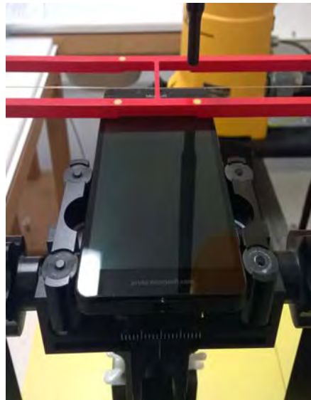
Photo of the device positioned under Test Arch

The device was positioned such that Device Reference plane was touching the bottom of the Test Arch. The scan is centered at the acoustic output by aligning the acoustic output with the intersection of the Test Arch's middle bar and dielectric wire.