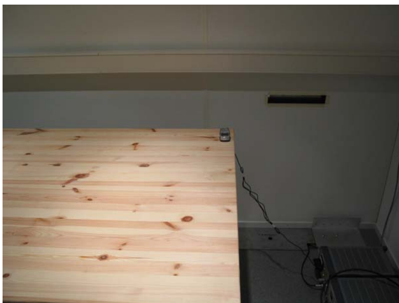
Picture 1 EUT test setup