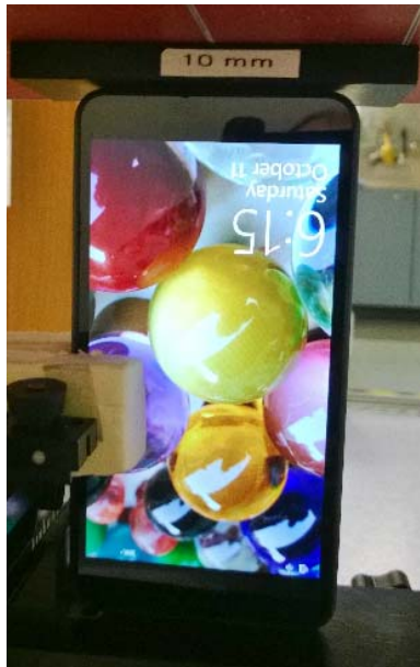
Photo of the device positioned for WR mode measurement – bottom edge facing phantom. The spacer was removed before the start of the measurements.