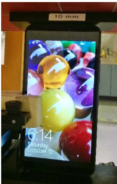
Photo of the device positioned for WR mode measurement – top edge facing phantom. The spacer was removed before the start of the measurements.