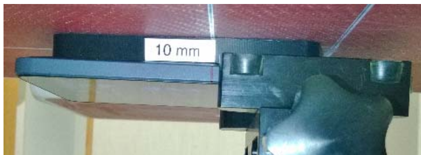
Photo of the device positioned for WR mode measurement –back facing phantom. The spacer was removed before the start of the measurements.

The device was placed in the SPEAG holder using the Microsoft spacer and, in sequence, the back, display and each of the 4 edges was positioned 10.0mm away from the flat phantom. The spacer was removed before the start of the measurements.