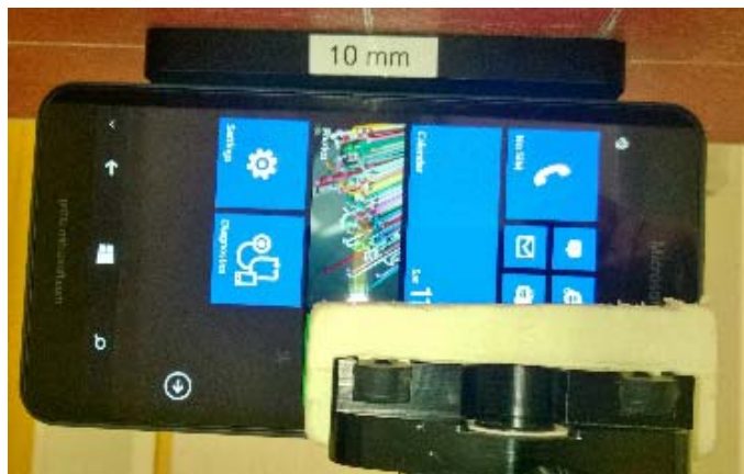
Photo of the device positioned for WR mode measurement – left edge facing phantom. The spacer was removed before the start of the measurements.