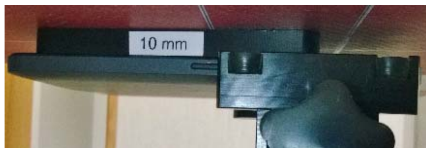
Photo of the device positioned for WR mode measurement – display facing phantom. The spacer was removed before the start of the measurements.