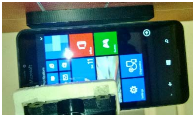
Photo of the device positioned for WR mode measurement – right edge facing phantom. The spacer was removed before the start of the measurements