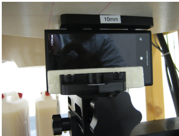
Photo of the device positioned for WR mode measurement – right edge facing phantom. The spacer was removed before the start of the measurements.