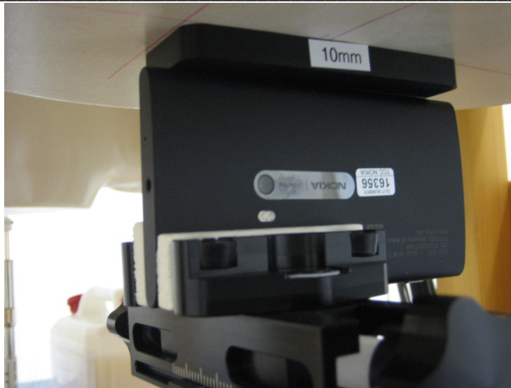
Photo of the device positioned for WR mode measurement – left edge facing phantom. The spacer was removed before the start of the measurements.