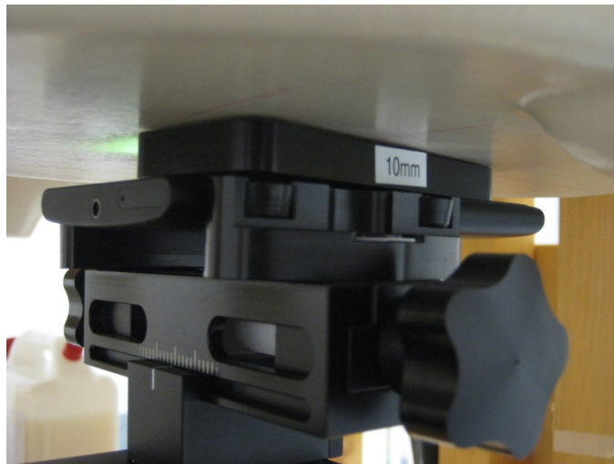
Photo of the device positioned for WR mode measurement – display facing phantom. The spacer was removed before the start of the measurements.