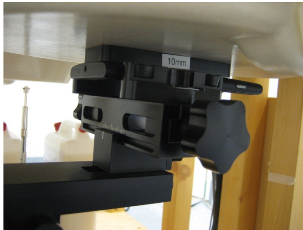
Photo of the device positioned for WR mode measurement –back facing phantom. The spacer was removed before the start of the measurements.

The device was placed in the SPEAG holder using the Nokia spacer and, in sequence, the back, display and each of the 4 edges was positioned 10.0mm away from the flat phantom. The spacer was removed before the start of the measurements.