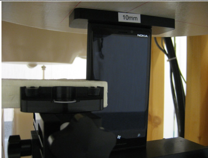
Photo of the device positioned for WR mode measurement – top edge facing phantom. The spacer was removed before the start of the measurements.