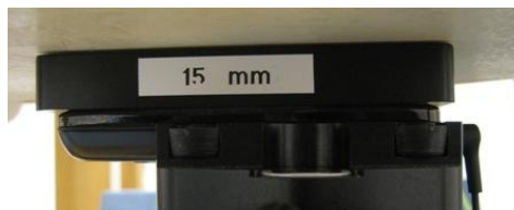
Photo of the device positioned for Body SAR measurement. The spacer was removed for the tests.

The device was placed in the SPEAG holder using the Nokia spacer and placed below the flat section of the phantom. The distance between the device and the phantom was kept at the separation distance indicated in the photo below using a separate flat spacer that was removed before the start of the measurements.