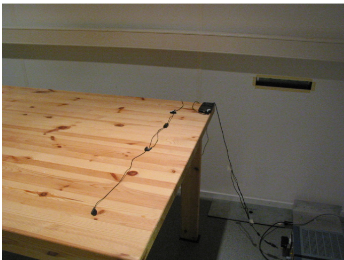
Picture 3 AC powerline conducted emission measurement 15C