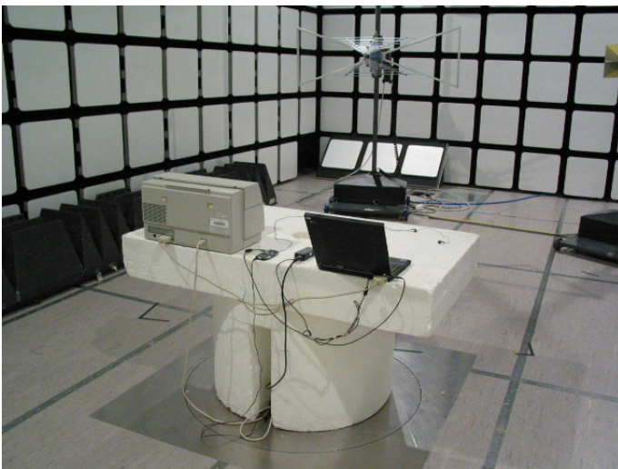
Picture 2 Radiated emission 15B