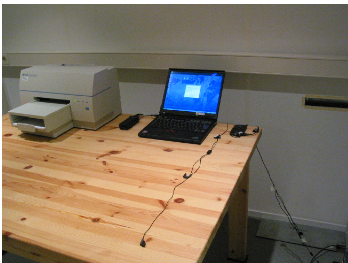
Picture 4 AC powerline conducted emission measurement 15B