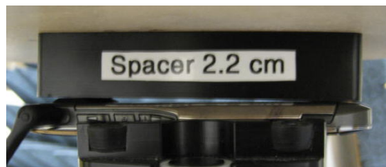
Photo of the device positioned for Body SAR measurement. The spacer was removed for the tests.

The device was placed in the SPEAG holder using the Nokia spacer and placed below the flat section of the phantom. The distance between the device and the phantom was kept at the separation distance indicated in the photo below using a separate flat spacer that was removed before the start of the measurements. The device was oriented with both sides facing the phantom to find the highest results.