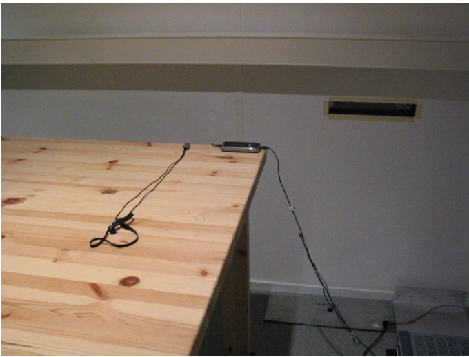
Picture 3 AC powerline conducted emission measurement 15C