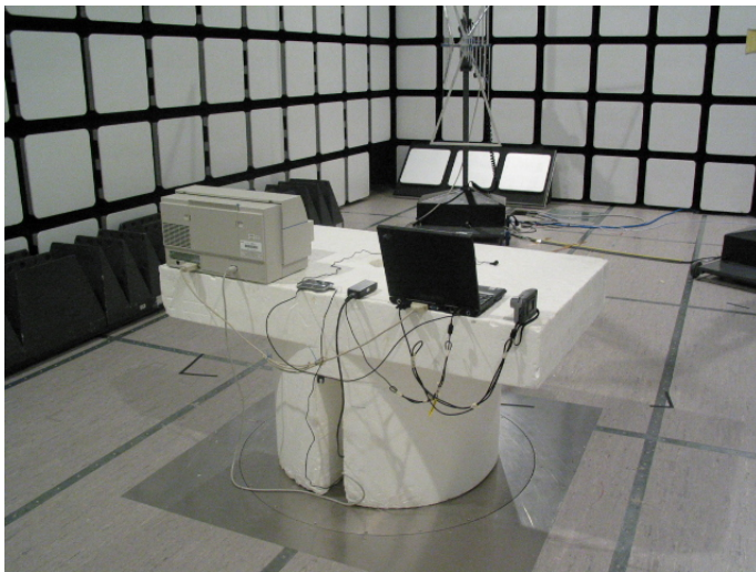
Picture 2 Radiated emission 15B