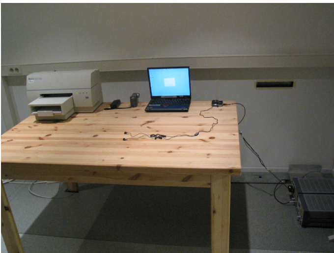
Picture 4 AC powerline conducted emission measurement 15B