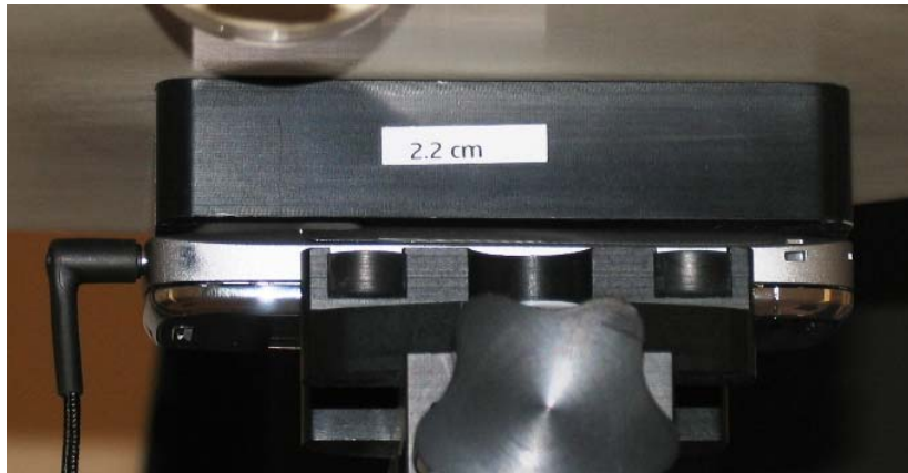
Photo of the device positioned for Body SAR measurement. The spacer was removed for the tests.

The device was placed in the SPEAG holder using the Nokia spacer and placed below the flat section of the phantom. The distance between the device and the phantom was kept at the separation distance indicated in the photo below using a separate flat spacer that was removed before the start of the measurements. The device was oriented with both sides facing the phantom to find the highest results.