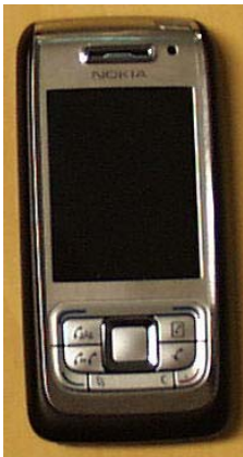
Device with slide closed