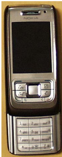
Device with slide open