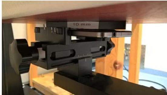
Photo of the device positioned for WR mode measurement –back facing phantom. The spacer was removed before the start of the measurements.

The device was placed in the SPEAG holder using the Microsoft spacer and, in sequence, the back, display and each of the 4 edges was positioned 10 mm away from the flat phantom. The spacer was removed before the start of the measurements.