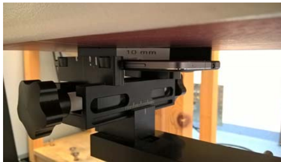
Photo of the device positioned for WR mode measurement – display facing phantom. The spacer was removed before the start of the measurements.