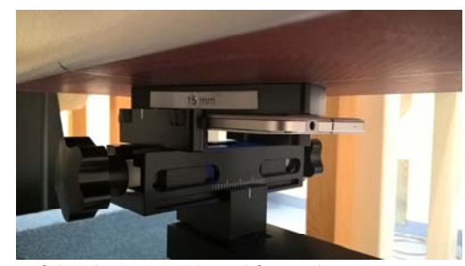
Photo of the device positioned for Body SAR measurement. The spacer was removed for the tests.

The device was placed in the SPEAG holder using the Microsoft spacer and placed below the flat phantom. The distance between the device and the phantom was kept at the separation distance indicated in the photo below using a separate flat spacer that was removed before the start of the measurements. The device was oriented with both sides facing the phantom to find the highest results.