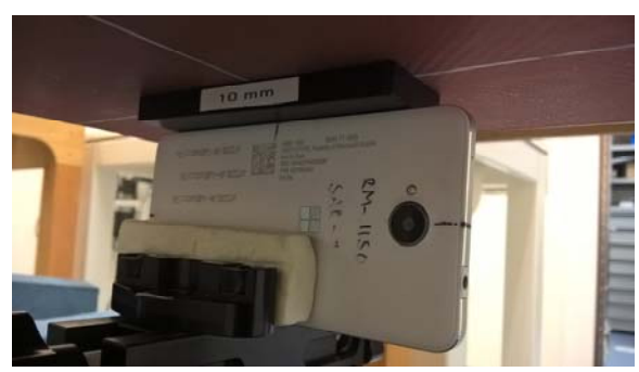
Photo of the device positioned for WR mode measurement – right edge facing phantom. The spacer was removed before the start of the measurements