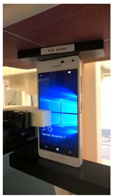
Photo of the device positioned for WR mode measurement – top edge facing phantom. The spacer was removed before the start of the measurements.