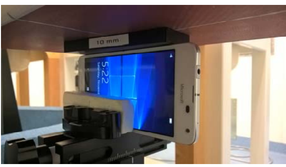
Photo of the device positioned for WR mode measurement – left edge facing phantom. The spacer was removed before the start of the measurements.