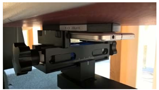
Photo of the device positioned for WR mode measurement –back facing phantom. The spacer was removed before the start of the measurements.

The device was placed in the SPEAG holder using the Microsoft spacer and, in sequence, the back, display and each of the 4 edges was positioned 10 mm away from the flat phantom. The spacer was removed before the start of the measurements.